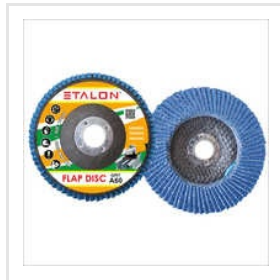
Zirconia Flap Disc