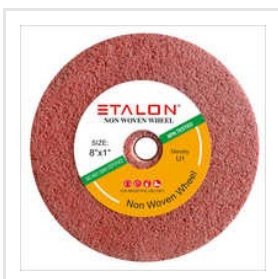
8x1 Inch Non Woven Wheel