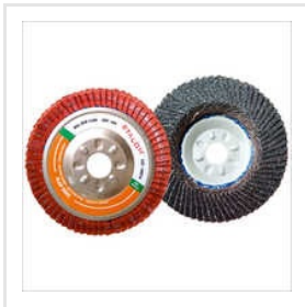
Metal Flap Disc