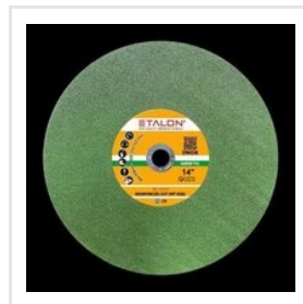
14 Inch Cut Off Cutting Wheel