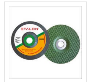
Flexible Grinding Disc