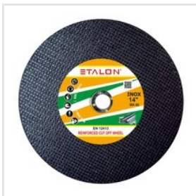
10" Cutting Disc