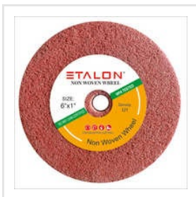
6x1 Inch Non Woven Wheel