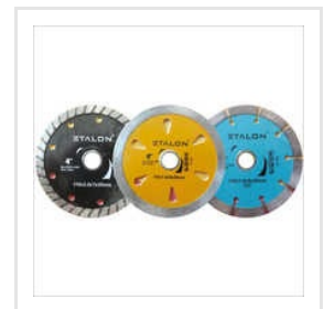
Diamond Cutting Wheel