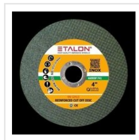
Metal Cutting Wheel