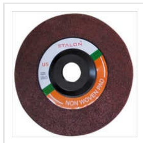
105x15 Non Woven Pad