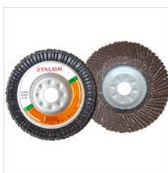
METAL BACKING FLAP DISC