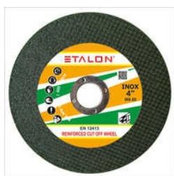
4 INCH REINFORCED CUT OFF CUTTING WHEEL

10" cutting disc, 100x15 Abrasive Non Woven Pad, 105x15 Non Woven Pad, 14 inch Cut Off Cutting Wheel, 4 inch Reinforced Cut Off Cutting Wheel, 4 x 4 combi wheel, 6" velcro disc, 6x1 inch Non Woven Wheel, 7 inch flap disc, 8x1 inch Non Woven Wheel, 8x2 inch Non Woven Wheel, Abrasive roll, Cutting Wheel Single Net, Diamond Cutting Wheel, Felt Disc, etc.