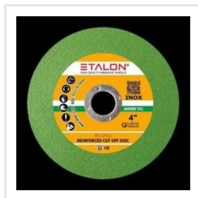
Cutting Wheel Single Net