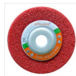
100X15 ABRASIVE NON WOVEN PAD