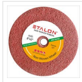
8x2 Inch Non Woven Wheel