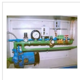
Instrumentation Control Panels