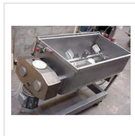
Paddle Mixer Machine