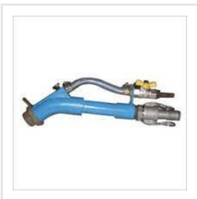
Heavy Machinery Parts