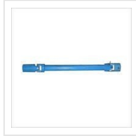
Industrial Machinery Components