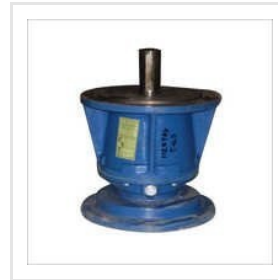
Automobile Machining Components