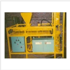
Portable Spraying Machine