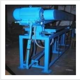
Refractory Brick Cutting Machine