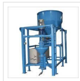
Construction Processing Machines