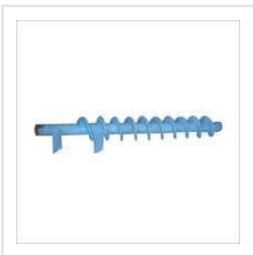
Precision Machine Parts