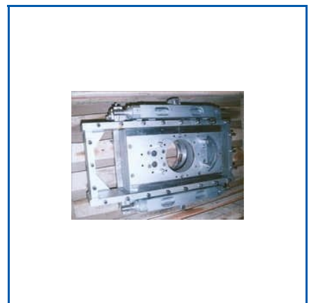
SLIDE GATE VALVE ASSEMBLY