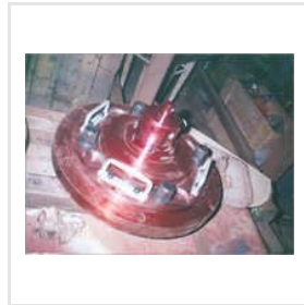
IPV Mechanism Assembly