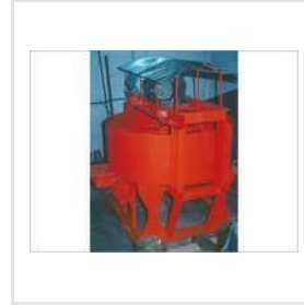
Pan Mixer Machine