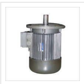
High Speed Mixer Machines