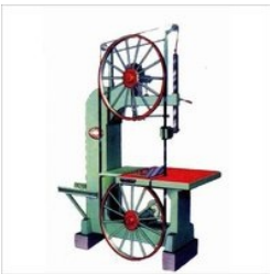
Band Saw Machine