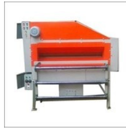
Plywood Dipping Machine