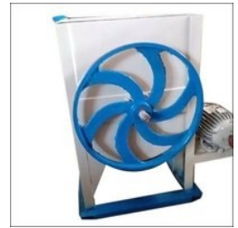
Plywood Burada Mixer Machine