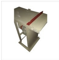
Ripping Cutter Machine