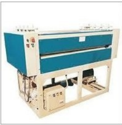
Plywood Brush Sanding Machine