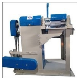
FRAME RIPSAW MACHINE