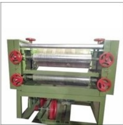
Glue Spreader Machine