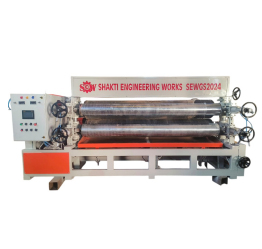
8 FOOT PNEUMATIC GLUE SPREADER