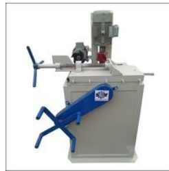
Plywood Finger Jointing Machinery