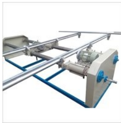
Plywood DD Saw Machines