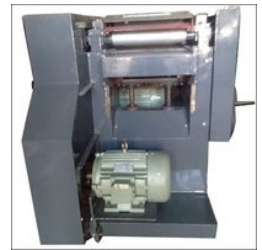
Thickness Planner Plywood Machine