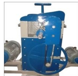
SMALL RIPSAW MACHINE