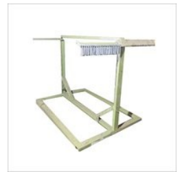
Plate Stand Machine