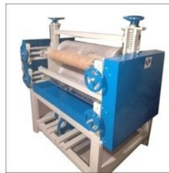
Column Based Glue Spreader Machine