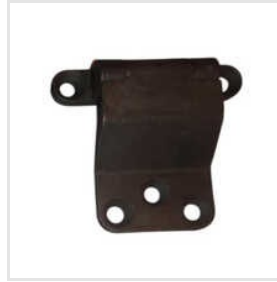
Automobile Door Hinge