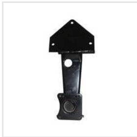
Black Steering Column Assembly