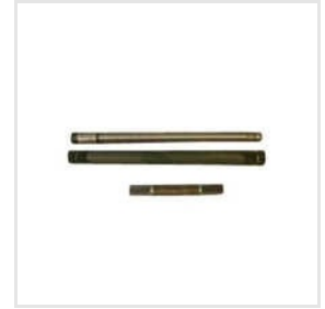
Spline Rolled Components