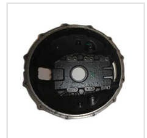
Engine Clutch Housing