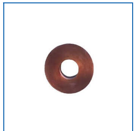
ROUND GEAR BLANKS