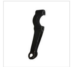
Engine Mounting Arms Steering Arms