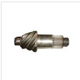
Pinion Ground Shaft