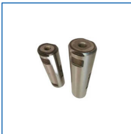
SPRING PINS LEVER PINS