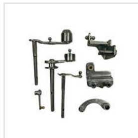
Gear Shifting Levers