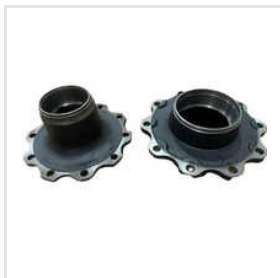
Truck Wheel Hubs