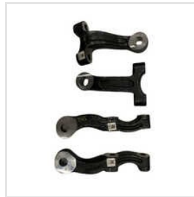
Automotive Steering Arms