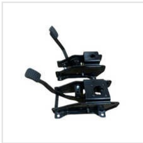
Clutch Break Pedal Assembly