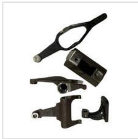
Clutch Release Yoke