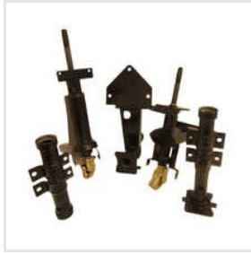
Steering Column Assemblies