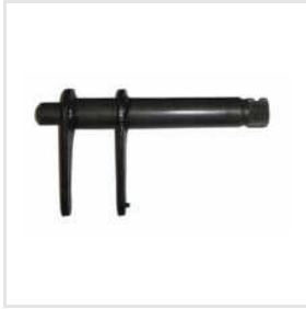
Clutch Yokes Lever