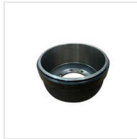
Truck Brake Drum