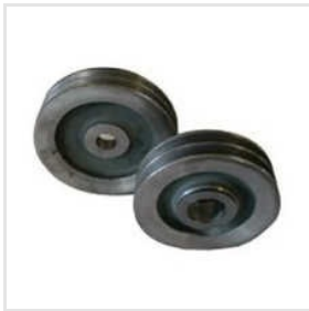
Cast Iron Desiel Engine Pulley