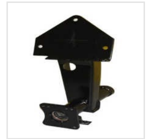
1.5kg Steering Column Assemblies