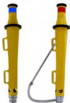
FOAM BRANCH FB-2, FB-10, FB-20