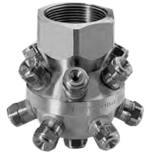
TANK CLEANING NOZZLE