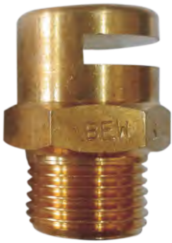
WATER SPRAY CURTAIN NOZZLE