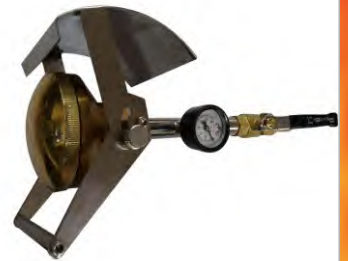
IPX3 / IPX4 SPRAY NOZZLE