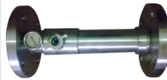
INDUCTOR - SS