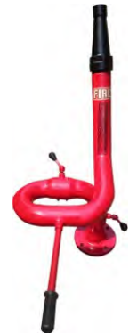
STAND POST TYPE WATER MONITOR