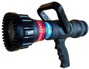
FAST ACTION NOZZLE