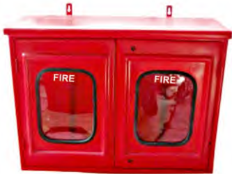
FRP HOSE BOX