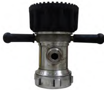
AQUA FOAM NOZZLE STAINLESS STEEL