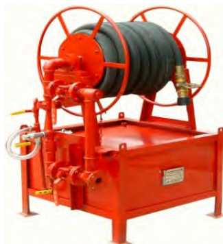
HOSE REEL TANK ASSEMBLY