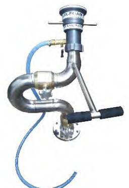
STAINLESS STEEL FOAM MONITOR