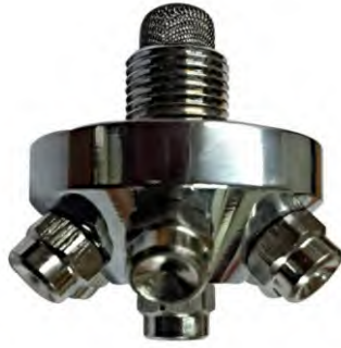
MULTI MIST NOZZLE