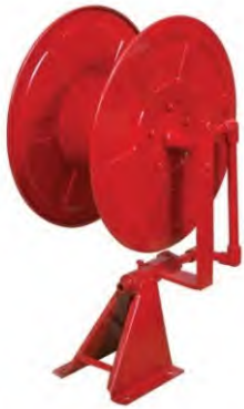
SWINGING TYPE HOSE REEL