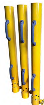
FOAM BAREL FOR MONITOR