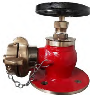
MARINE BRONZE HYDRANT VALVE