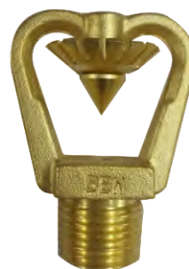
MEDIUM VELOCITY SPRAY NOZZLE