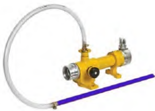
INLINE INDUCTOR (INLINE FOAM INDUCTOR)