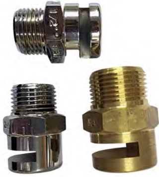
TANK COOLING NOZZLE