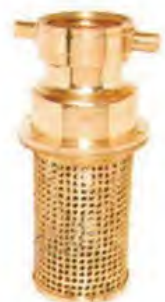
FOOT VALVE STRAINER