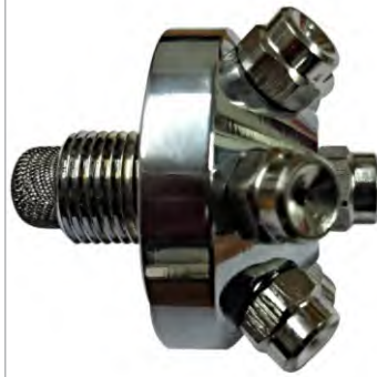
WATER MIST NOZZLE