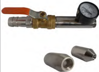
IPX5 / IPX6 JET NOZZLE