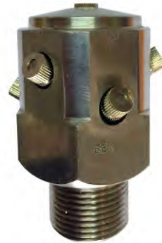
FIRE MIST NOZZLE