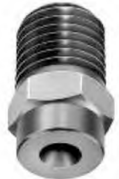
FULL CONE NOZZLE