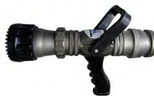
SELECTABLE FLOW CONTROL NOZZLE