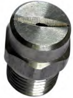
FLAT JET NOZZLE