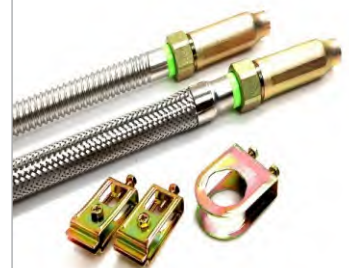
FLEXIBLE SPRINKLER HOSE