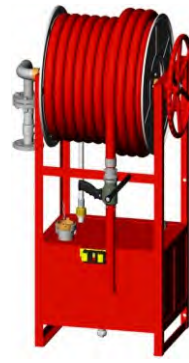
HOSE REEL WITH FOAM TANK ASSEMBLY