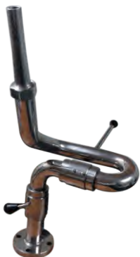
STAND POST MONITOR (S.S.)