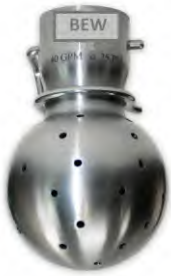
TANK CLEANING NOZZLE