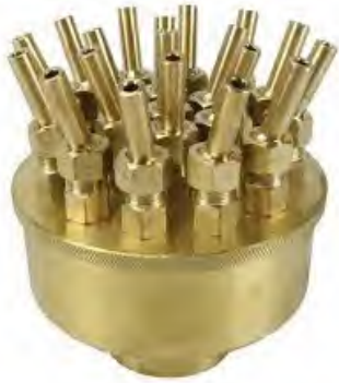
ADJUSTABLE FOUNTAIN NOZZLE