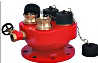
FOUR WAY INLET BREACHING