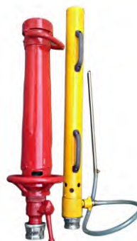
FOAM NOZZLE WITH JET SPRAY AND SHUTT