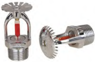
WATER SPRINKLER WITH BULB