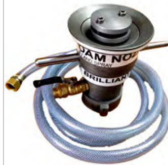
AQUA FOAM NOZZLE ALLUMINIUM ALLOY