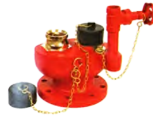
TWO WAY BREACHING