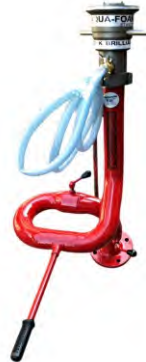
STAND POST FOAM MONITOR