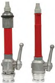
HAND CONTROLLED BRANCH PIPE