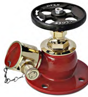
SINGLE HEADED HYDRANT VALVE