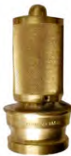
NAVY TYPE NOZZLE