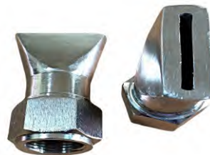
FLAT JET NOZZLE