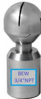
TANK CLEANING NOZZLE