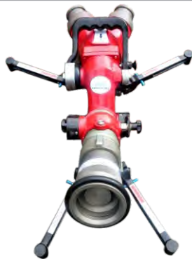
DOUBLE INLET PORTABLE WATER MONITOR