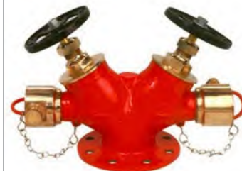
DOUBLE HEADED HYDRANT VALVE