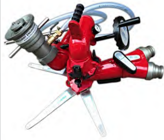
PORTABLE FOAM MONITOR