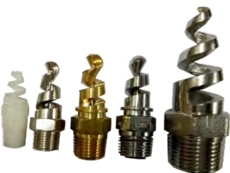
FULL CONE NOZZLE