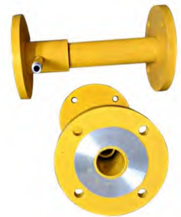
INLINE EDUCTOR (SMALL SIZE)