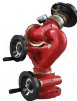
STAND POST MONITOR (S.S.)