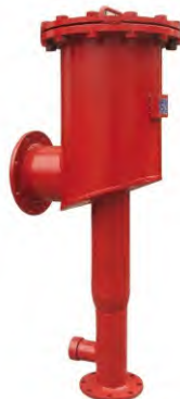
FOAM CHAMBER WITH VAPOUR SEAL