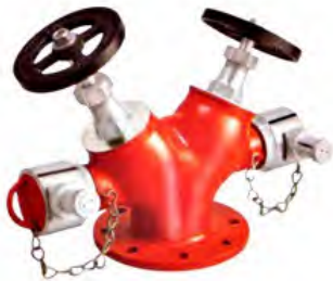
STEEL DOUBLE HEADED HYDRANT VALVE