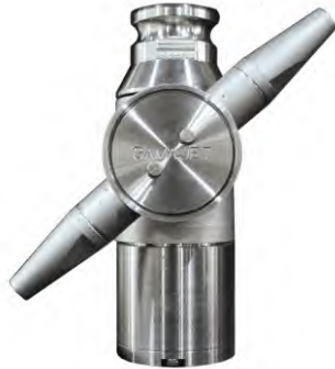
TANK CLEANING NOZZLE