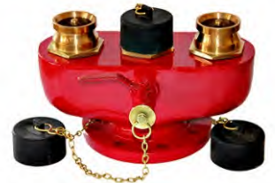
THREE WAY INLET BREACHING