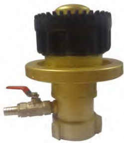
AQUA FOAM NOZZLE GUN METAL