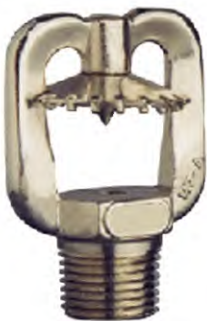
WATER SPRINKLER UPRIGHT