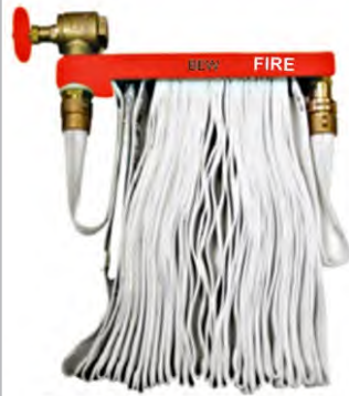
HOSE RACK ASSEMBLY