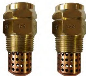
HIGH VELOCITY WATER SPRAY NOZZLE