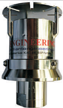
FOAM SPRINKLER FEMALE