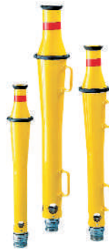
FOAM BRANCH FB-2, FB-10, FB-20