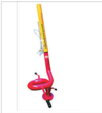
WATER COME FOAM MONITOR