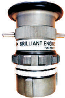
FLOW CONTROL NOZZLE