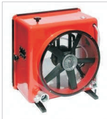
HIGH-EXPANSION FOAM GENERATOR