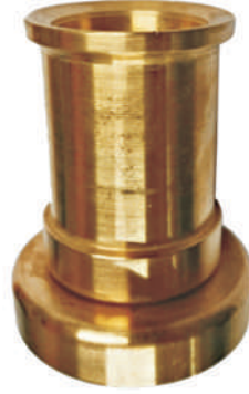
HOSE REEL NOZZLE