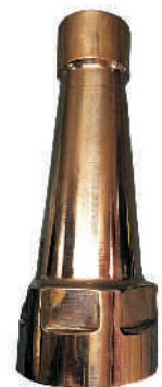
JET NOZZLE FOR MONITOR