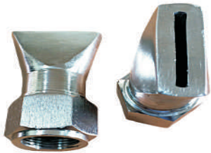
FLAT JET NOZZLE