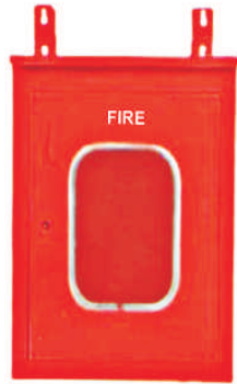
SINGLE HOSE BOX