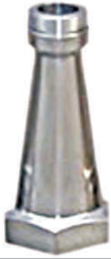
JET NOZZLE ALUMENIUM