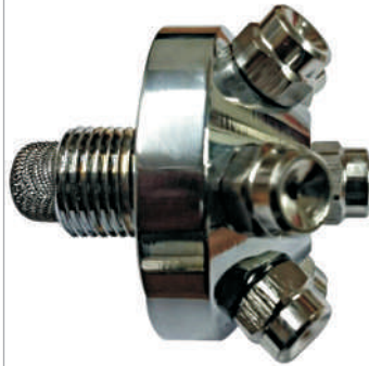
WATER MIST NOZZLE