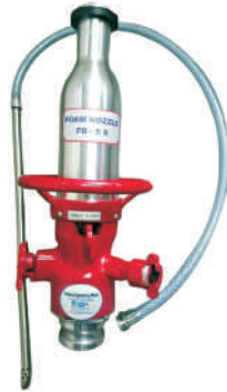
FOAM MAKING BRANCH PIPE FB-5X