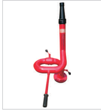
STANDPOST WATER MONITOR