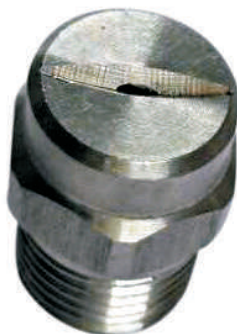
FLAT JET NOZZLE