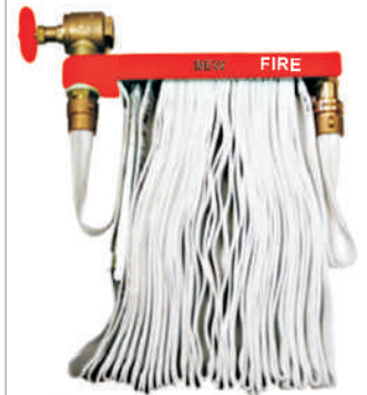
HOSE RACK ASSEMBLY