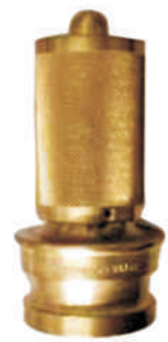
NAVY TYPE NOZZLE