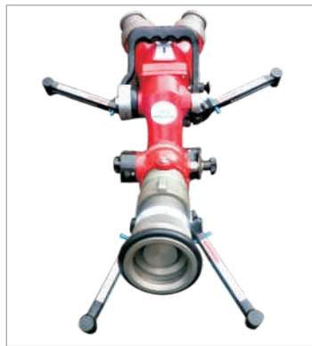
DOUBLE INLET PORTABLE WATER MONITOR