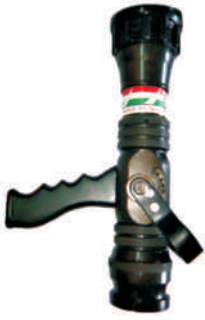
AUTO PRESSURE JET SPRAY NOZZLE