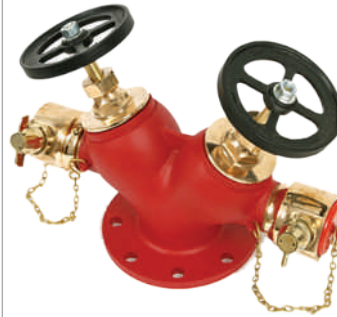
DOUBLE HYDRANT VALVE