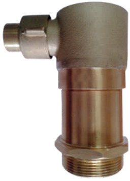
HOSE RACK ADAPTER