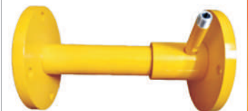
FLANGE TYPE INDUCTOR