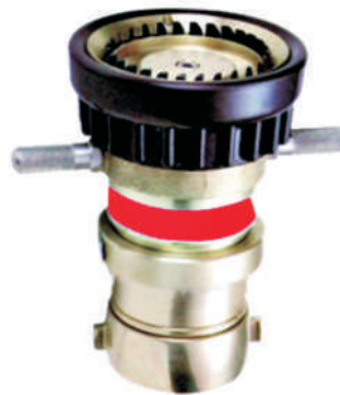
JET SPRAY NOZZLE(G.M.)