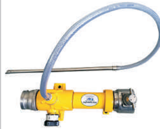
INLINE INDUCTOR (INLINE FOAM INDUCTOR)