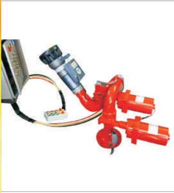
REMOTE CONTROL MONITOR