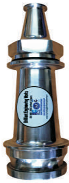
SHORT BRANCH PIPE