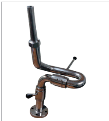
STAND POST MONITOR (S.S.)