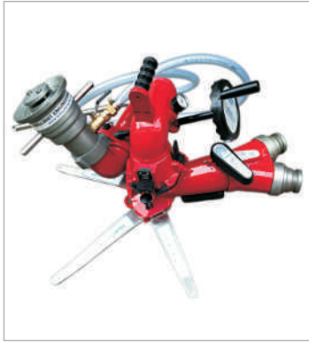
PORTABLE FOAM MONITOR