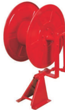
SWINGING TYPE HOSE REEL