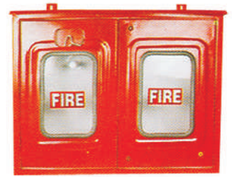
MS HOSE BOX