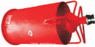
FOAM POURAR MILD STEEL