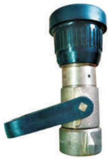
JET SPRAY NOZZLE