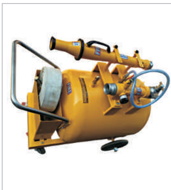
Mobile Foam Unit Mild Steel Trolley