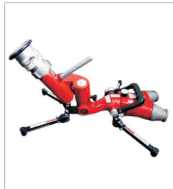
LIGHT WIEGT PORTABLE WATER MONITOR