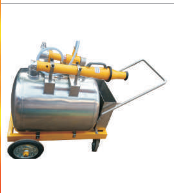
MOBILE FOAM TROLLY(S.S.)