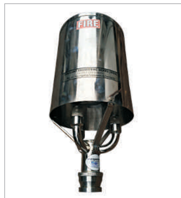
FOAM POURAR (S.S.)