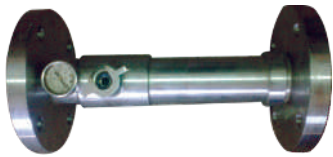
INDUCTOR - SS