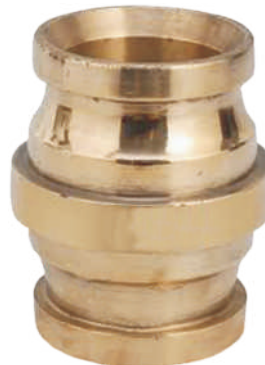
DOUBLE MALE ADAPTER