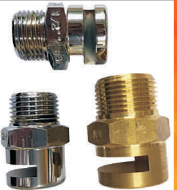
TANK COOLING NOZZLE