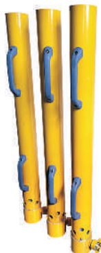
FOAM BAREL FOR MONITOR