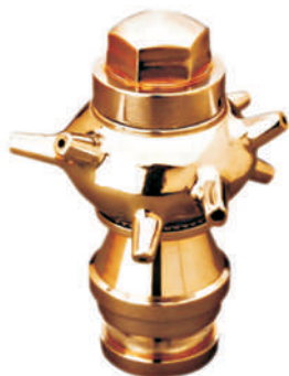
REVOLVING SPRAY NOZZLE