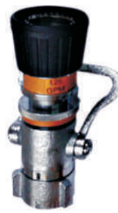
FLOW CONTROL NOZZLE