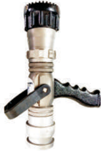
MULTI PURPOSE NOZZLE