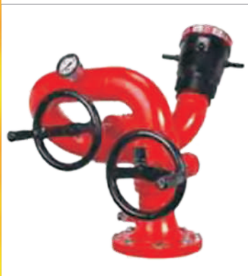
LONG RANGE WATER MONITOR