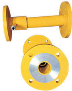
INLINE EDUCTOR (SMALL SIZE)