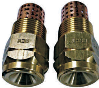
HIGH VELOCITY SPRAY NOZZLE