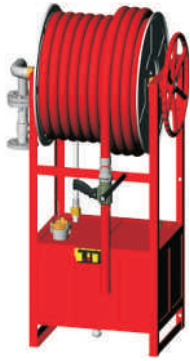
HOSE REEL WITH FOAM TANK ASSEMBLY