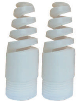
PP SPIRAL NOZZLE