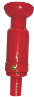
HOSE REEL NOZZLE