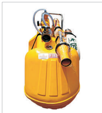
MOBILE FOAM UNIT(FRP)