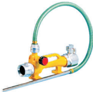
FOAM TYPE INDUCTOR