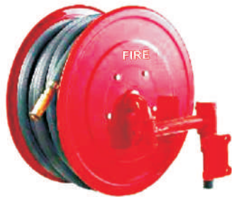
HOSE REEL DRUM 30 METER