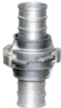
STORZ HOSE COUPLING