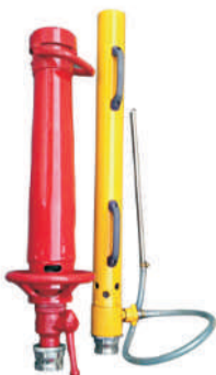
FOAM NOZZLE WITH JET SPRAY AND SHUTT