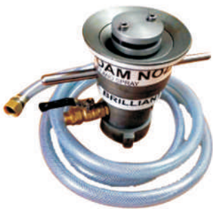
FOAM SUCTION NOZZLE