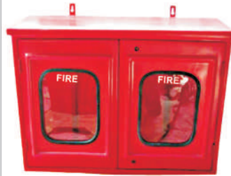
FRP HOSE BOX