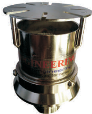
FOAM SPRINKLER MALE