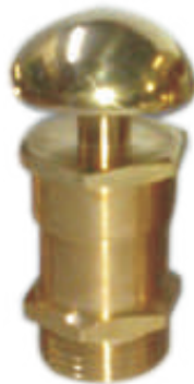
AIR RELEASE VALVE