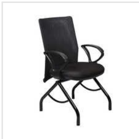
Visitor Chair For Office