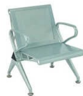
SINGLE SITTER WAITING CHAIR