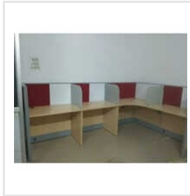
L Shape Workstation