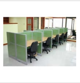
Office Modular Workstation