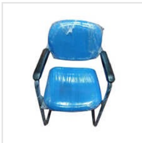
Office Visitor Chair