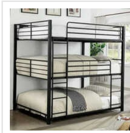
Metal Bunker Cot Bed