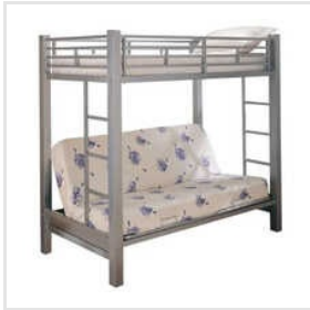
Bunker Cot With Sofa Set