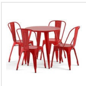
Cafe Table With Chair Set