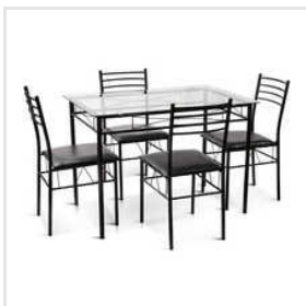
Black Dining Table