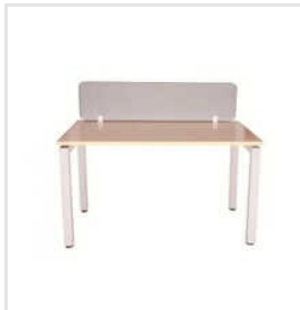
Single Workstation Table