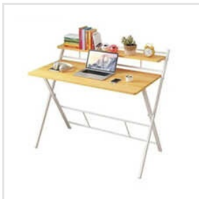
Lap Top And Study Table