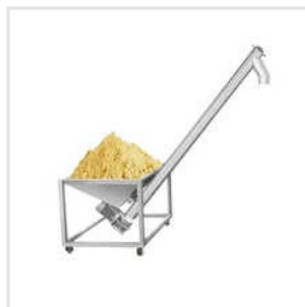
Powder Loading System