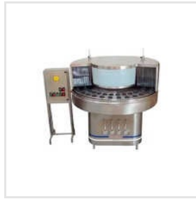
Rotary Bottle Washing Machine