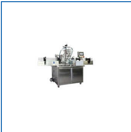
AUTOMATIC LABELLING MACHINE

AC Brake Motor, Aluminum AC Motor, Crane Duty Gearbox, Double Universal Joint, Electric Motor, Flange Mounted Worm Reduction Gearbox, Flange Mounting Motor, Gear Box, Gear Reducer, Hand Hand Sanitizer Machine, Horizontal Gearbox, Horizontal Helical Gearbox, Horizontal Single Worm Reduction Gearbox, Hydraulic Test Pump, NMRV Worm Gearbox, etc.