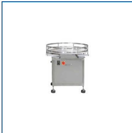
TURN TABLE MACHINE