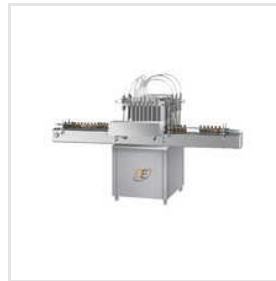
Automatic Liquid Filling Machine