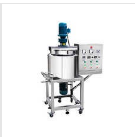
Dual Mixing Tank