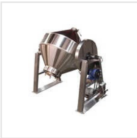
Double Cone Mixture