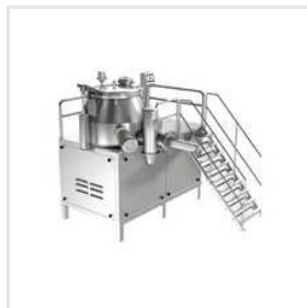
Rapid Mixer Granulator