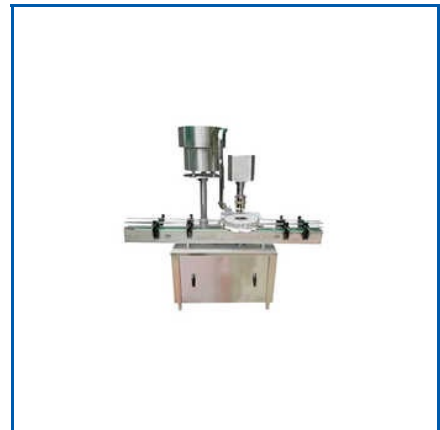
AUTOMATIC CAPPING MACHINE