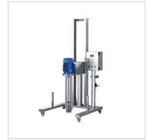
Stainless Steel Homogenizer