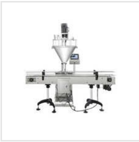
Auger Powder Filling Machine