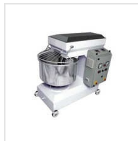
Dough Spiral Mixture