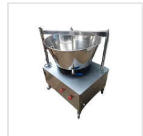
Khoya-Mava Making Machine