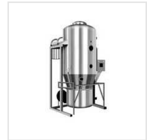
Fluid Bed Dryer