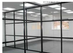
Aluminium Glass Partition