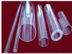
Transparent Glass Tube