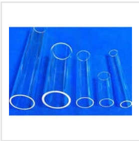
Borosilicate Glass Tube