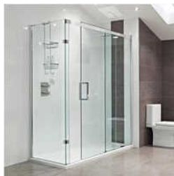
Shower Glass Partition