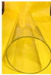
Quartz Glass Tube