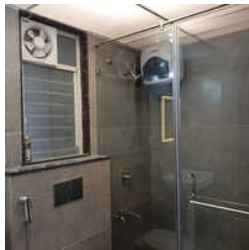
Toughened Glass Shower Partitions