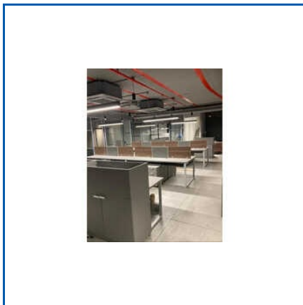
TOUGHENED GLASS DOOR

14 Mm Door Gasket, 18 Mm Plain Toughened Glass, 19 Mm Door Gasket, 21 mm Sight Glass, 40mm Borosilicate Glass Tube, 50 Mm Plain Toughened Glass, Aluminium Glass Door, Aluminium Glass Partition, Aluminium Modern Glass Door, Aluminosilicate Gauge Glass, Aluminum Office Partition, Automatic Glass Sliding Door, Automatic Sliding Glass Door, Balcony Glass Railing, Bathroom Glass Partition, etc.