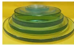
Laminated Round Toughened Glass