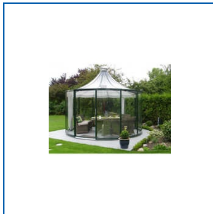
SAINT GOBAIN TOUGHENED GLASS