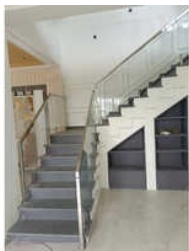
Bend Railing Toughened Glass