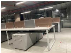
Modular Office Glass Partition