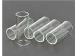
Plain Taper Rotameter Glass Tube