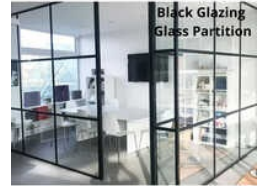
Black Glazing Glass Partition