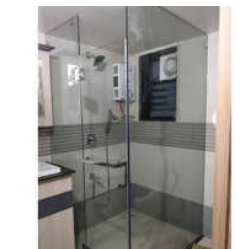
Bathroom Glass Partition