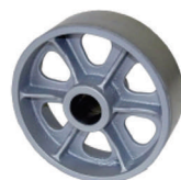
A1W - 33