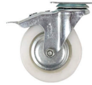
A1W - 4