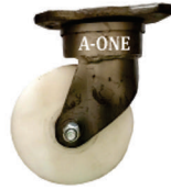
A1W - 3