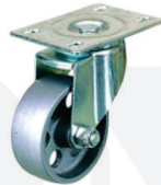
A1W - 18