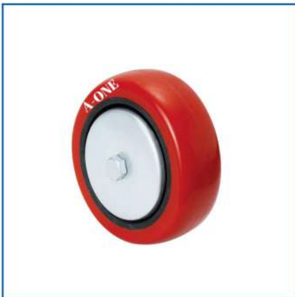
RED PU WHEEL

A ONE CASTER is a trusted manufacturer and exporter of premium industrial material handling trolleys and caster wheels . Specializing in high-quality, durable products, we cater to a diverse range of industries across the globe. As an established OEM supplier , we also provide custom solutions tailored to the unique needs of our clients. With years of expertise in the field, we are committed to offering reliable and cost-effective solutions for material handling challenges in industrial environments.