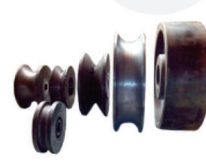
A1W - 34