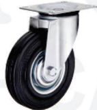
A1W - 22