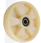
A1W - 20