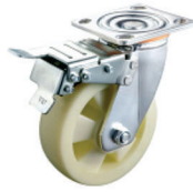
A1W - 2