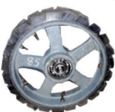
A1W - 31