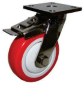
A1W - 1