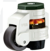
A1W - 30