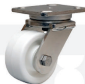
A1W - 29