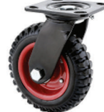
A1W - 9