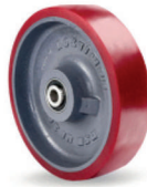
A1W - 13