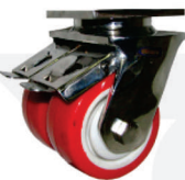
A1W - 26