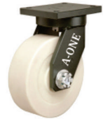
A1W - 5