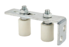
A1W - 35