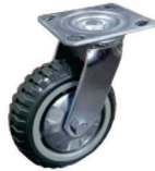
A1W - 7