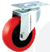
A1W - 17