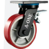
A1W - 25