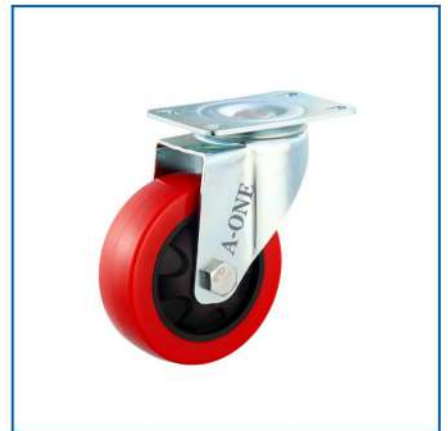
RED PU CASTER WHEEL