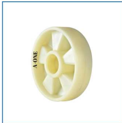
LOAD FRONT WHEEL