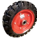
A1W - 8