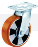
A1W - 27