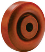
A1W - 11