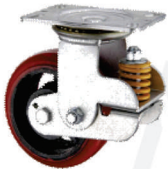
A1W - 16