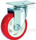
A1W - 21