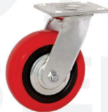
A1W - 23