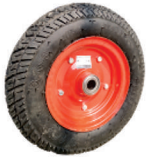
A1W - 6