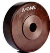
A1W - 12