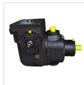
Eaton Vickers Hydraulic Gear Pump