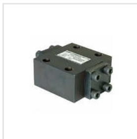
Hydraulic Pilot Operated Valve