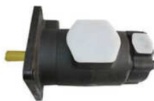
TOKIMEC TYPE DOUBLE VANE HYDRAULIC PUMP