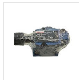
Hydraulic Relief Valve