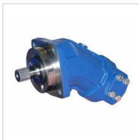
Axial Piston Pump