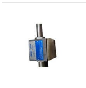
Hydraulic Miniature Valve