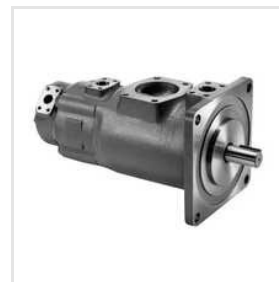
Tokimec Hydraulic Pump