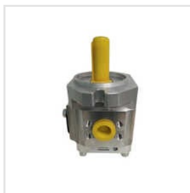
Industrial Rexroth Hydraulic Piston Pump