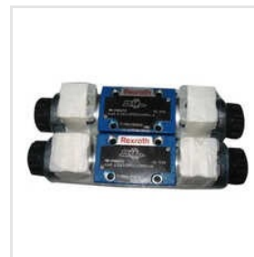
Pressure Hydraulic Valve