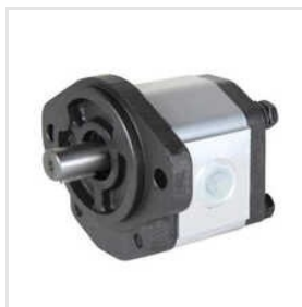
Hydraulic Gear Pump