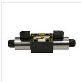
Directional Control Hydraulic Valve