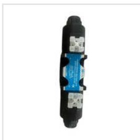
Hp Make Hydraulic Valve