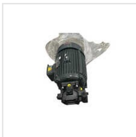
Hydraulic Pump With Motor Assembly