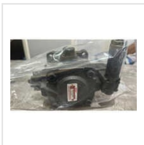
Bosch Hydraulic Pumps