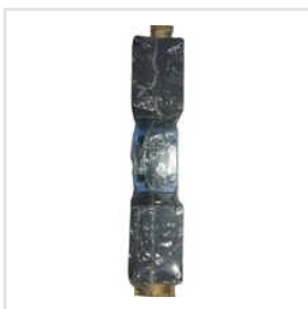
Hydraulic Rexroth Flame Proof Valve