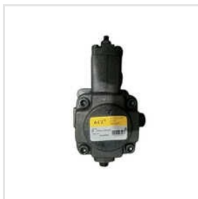
KCI Hydraulic Pump