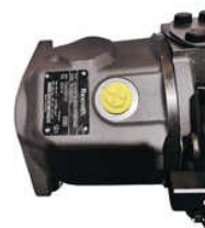
HYDRAULIC PISTON PUMP