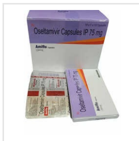
75mg Oseltamivir Capsules IP