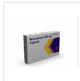
800mg Molnupiravir Capsules