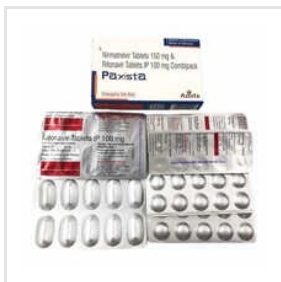
Nirmatrelvir Ritonavir Tablets IP