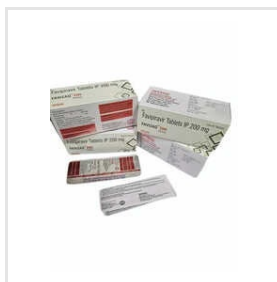
FAVIZAQ 200 Favipiravir 200mg