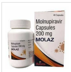
200mg Molaz Capsules