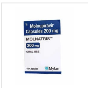
200mg Molnatis Capsules