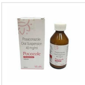
Pocozole 40mg Oral Suspension