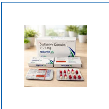
OSKOVIR 75MG OSELTAMIVIR 75 MG CAPSULES

150mg Combovir Nirmatrelvir & Ritonavir Tablets Combo, 200mg Favipiravir Tablet, 200mg Molaz Capsules, 200mg Molcovir Molnupiravir Capsules, 200mg Molnatrix Capsules, 200mg Xenon Molnupiravir Capsules, 400mg Favipiravir Tablet, 75mg Oseltamivir Capsules IP, 800mg Molnupiravir Capsules, Corovir Remdesivir 100mg Injection, FAVIZAQ 200 Favipiravir 200mg Tablets, Fabiflu 400 Mg Tablet, Favipiravir 400 Mg Favivir Tablet, Favipiravir Favivent Tablets, Molnulee 200, etc.