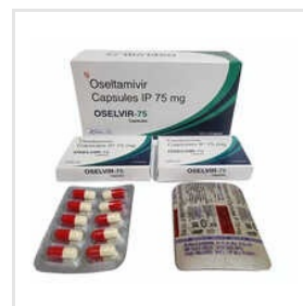
Oseltamivir 75mg Capsules