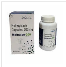
Molnulee 200, Molnupiravir Capsules