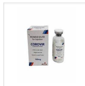
Corovir Remdesivir 100mg Injection