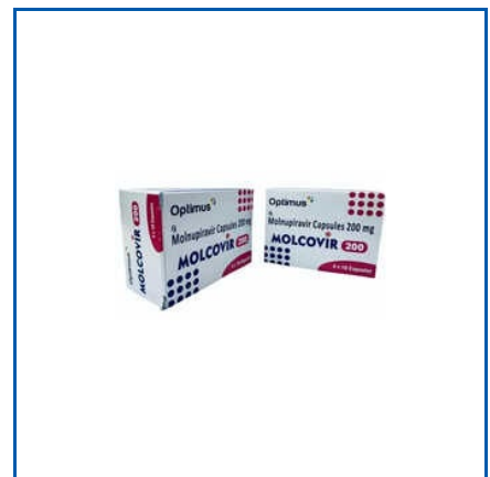
200MG MOLCOVIR MOLNUPIRAVIR CAPSULES