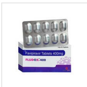
Favipiravir 400 Mg Favivir Tablet