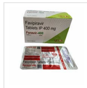
400mg Favipiravir Tablet