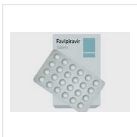
Favipiravir Favivent Tablets