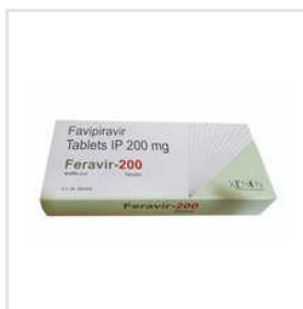
200mg Favipiravir Tablet