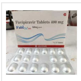
Fabiflu 400 Mg Tablet