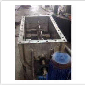
Hotel Waste Dryer