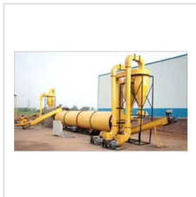
Rotary Drum Dryer