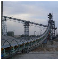
CHAIN AND SLAT CONVEYOR