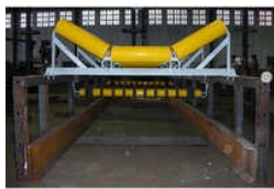
IDLER ROLLERS AND PULLEYS

Apron Conveyor, Band Dryer, Belt Conveyor, Bucket Elevator, Chain And Slat Conveyor, Deep Bucket Conveyor, Enmass Conveyor, Hotel Waste Dryer, Idler Rollers And Pulleys, Paddle Dryer, Pipe Belt Conveyor, Rotary Drum Dryer, Screw Conveyor, Sidewall Conveyor, etc.