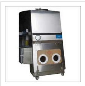
3 Type Bio Safety Cabinet