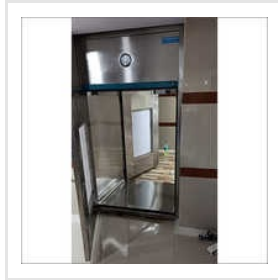
Big Size Pass Box