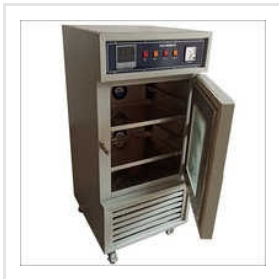
Lab BOD Incubator