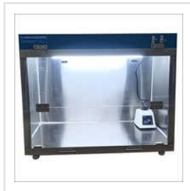
Lab PCR Cabinet