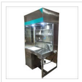
Lab Pathology Grossing Station