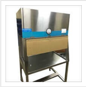
Horizontal Laminar Flow