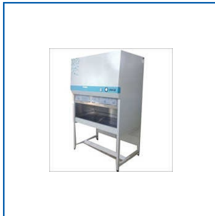
1 TYPE BIO SAFETY CABINET