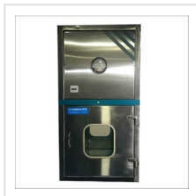
Dynamic Pass Box