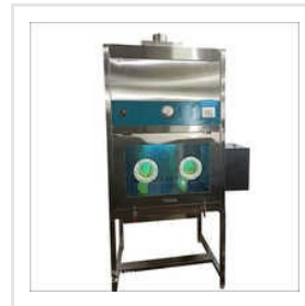
Class Glove Box