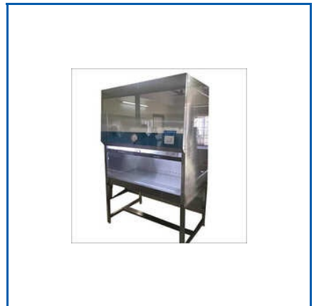
2 TYPE BIO SAFETY CABINET