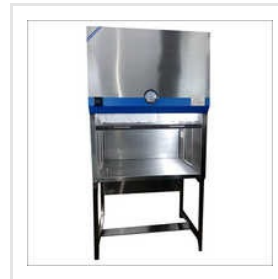
Vertical Laminar Flow