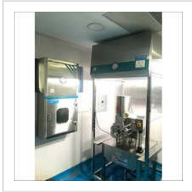
Lab Mobile Laminar Flow