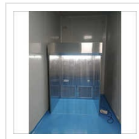
Lab Dispensing Booth