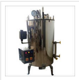
Lab Steel Autoclave