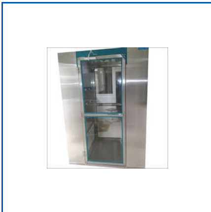
LAB AIR SHOWER

1 Type Bio Safety Cabinet, 2 Type Bio Safety Cabinet, 3 Type Bio Safety Cabinet, Big Size Pass Box, Class Glove Box, Dynamic Pass Box, Fume Cupboard, Garment Storage Cabinet, Horizontal Laminar Flow, Lab Air Shower, Lab BOD Incubator, Lab Clean Room Door, Lab Dispensing Booth, Lab Mobile Laf, Lab PCR Cabinet, etc.