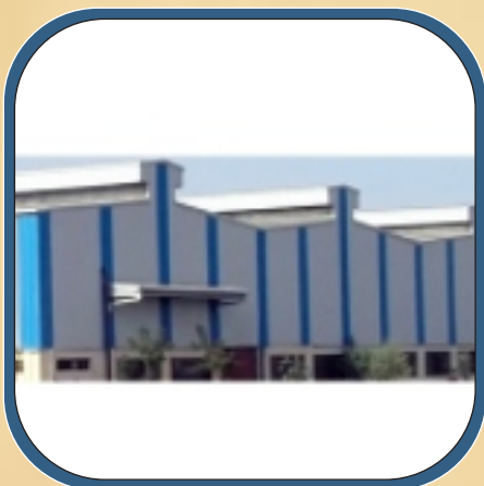
Prefabricated Warehouse Buildings