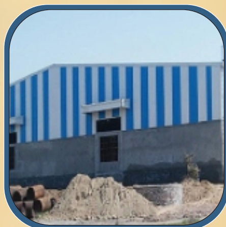
Factory Building Shed