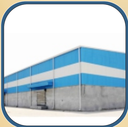
Prefabricated Warehouse Shed