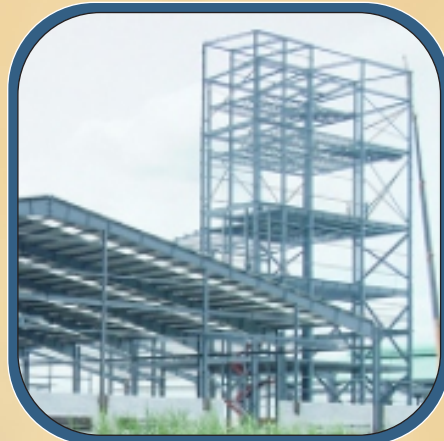
Prefab Steel Structures