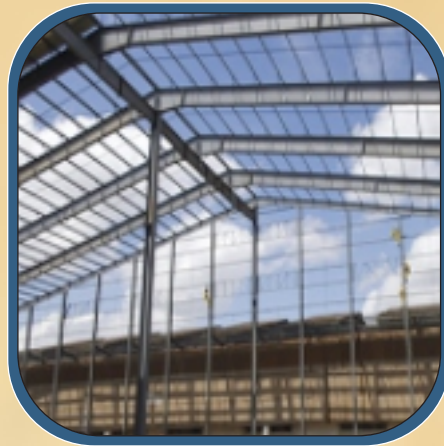
Light Gauge Frame Structure