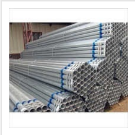
Galvanized Steel Scaffolding Pipe