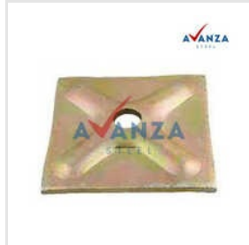
MS Waller Plate