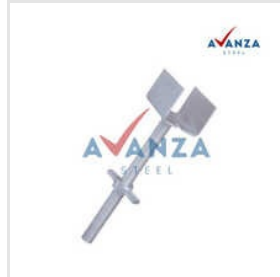
U Head Jack