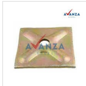
MS Waller Plate