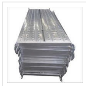
Steel Walkway Planks