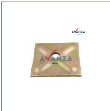
MS WALLER PLATE

Acro Span, Adjustable Base Jack, Aluminium Scaffolding Tower, Anchor Nut, BRC Clamp, Base Jack, Beam Clamp, Centering Plate, Centering Sheets, Column Shuttering, Construction Scaffolding System, Cuplock Scaffolding, Cuplock Scaffolding System, EN 74 Swivel Clamp, ERW Pipe, etc.