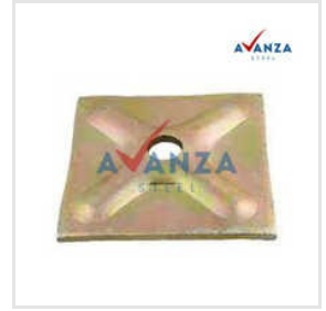
MS Waller Plate