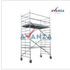
Scaffolding Tower With Wheel