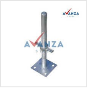
Adjustable Base Jack