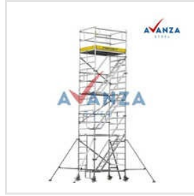
Aluminium Scaffolding Tower