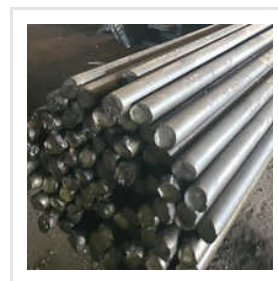
Bright Round Bar