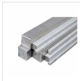
Steel Plain Square Bars