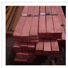
Flat Crane Rails