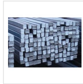
Steel Square Bars