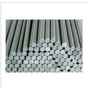
Steel Round Bars