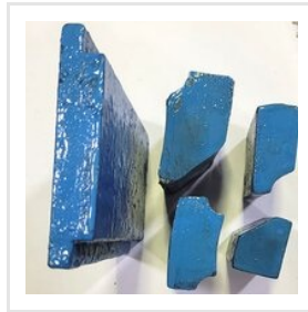
Stainless Steel Section