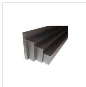
Steel Rectangular Flat Bars