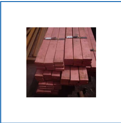
FLAT CRANE RAILS

Bright Round Bar, Bright Square Bar, Flat Crane Rails, Industrial Steel Bars, Stainless Steel Section, Steel Equal Angle, Steel Flat Bars, Steel Plain Square Bars, Steel Rectangular Flat Bars, Steel Round Bars, Steel Section, Steel Square Bars, etc.