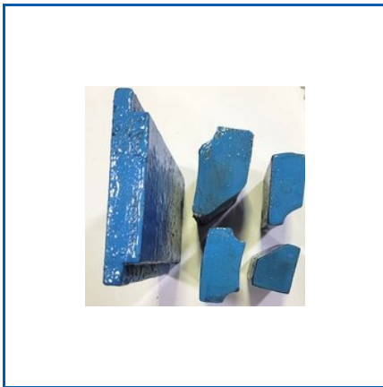
STAINLESS STEEL SECTION