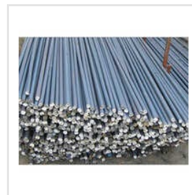
Industrial Steel Bars