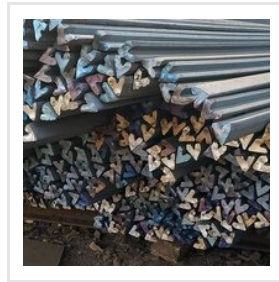
Steel Equal Angle