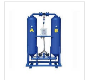
Heatless Air Dryer