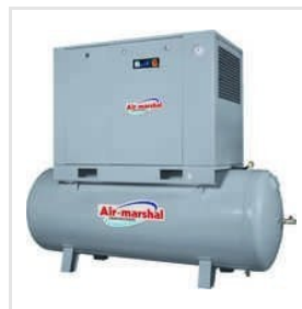
Screw Compressor With Air Dryer