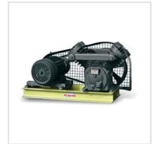
Dry Vacuum Pressure Pumps