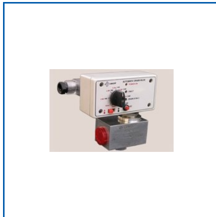
AUTOMATIC DRAIN VALVES