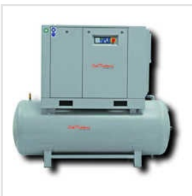
Rotary Screw Air Compressor