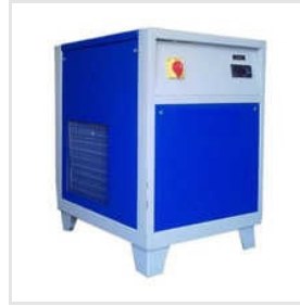
Refrigerated Air Dryer