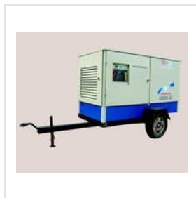
Portable Screw Compressor