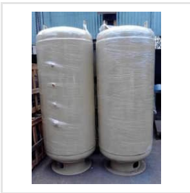
Air Receiver Tank