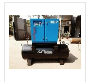
Tank Mounted Screw Compressor