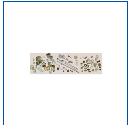
AIR COMPRESSOR SPARE PARTS