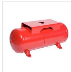
Horizontal Air Receiver Tank