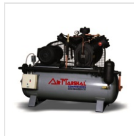
PET Blowing Air Compressor