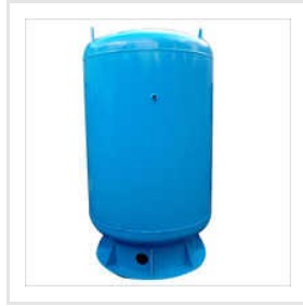
Industrial Air Receiver Tank