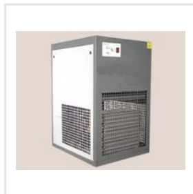
Industrial Air Dryer