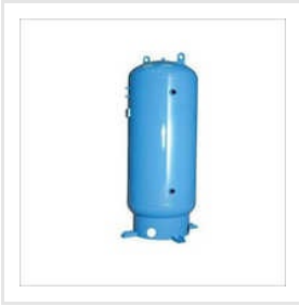
Vertical Air Receiver Tank