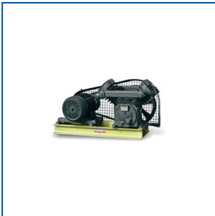
DRY VACUUM PRESSURE PUMPS

Air Marshal Air Compressor, Automobile Engine Accessories, Connecting Rod, Crankshaft, Cylinder, High Pressure Air Compressor, Portable Air Compressor, Single Stage Air Compressor, Single Stage Low Pressure Air Compressor, Single Stage Low Pressure Compressor, Vertical Air Compressor, Vertical Single Stage Air Compressor, etc.