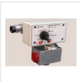
Automatic Drain Valves