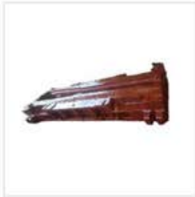
Casting For Tool And Die Industry