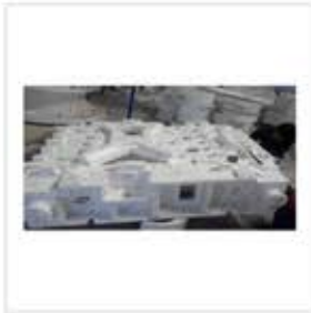
In-House Pattern Casting