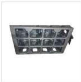
Tool & Die Casting