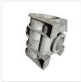
Vacuum Pump Casting