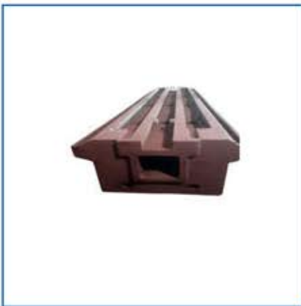
LONG LATHE MACHINE BEDS

Cast Iron Casting, Casting For Tool And Die Industry, Column And Double Column SG Iron Castings, Continuous Sand Mixers Machine, Crusher Casting, Fettled Raw Casting for Machine Tool, In-house Pattern Casting, Industrial Gate Valve Casting, Long Lathe Machine Beds, etc.