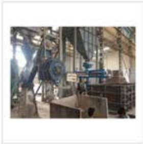
Continuous Sand Mixers Machine