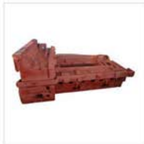
Special Purpose Machine Bed Casting