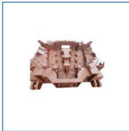
TOOL & DIE CASTING