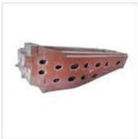
Column And Double Column SG Iron