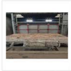
Stress Relieving, Normalizing And Stress