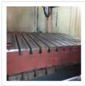
T-Slotted Plate Casting For Machine Tool