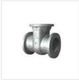
Industrial Gate Valve Casting