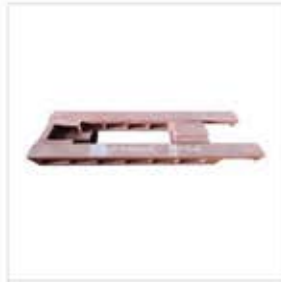
Painted Un-Machined Carriage Base Casting