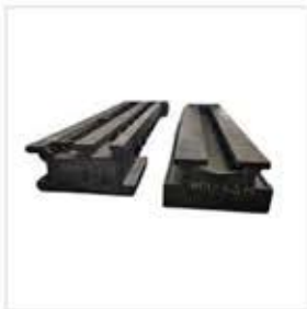
Fettled Raw Casting For Machine Tool