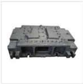
Cast Iron Casting