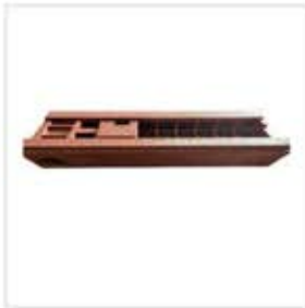
Painted Un Machined Carriage Casting