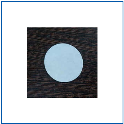
DOUBLE SIDED TAPE EVA FOAM