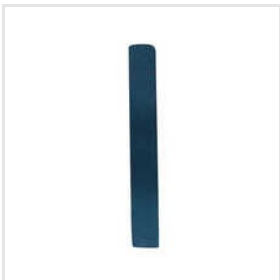
High Quality EPDM Foam Strip