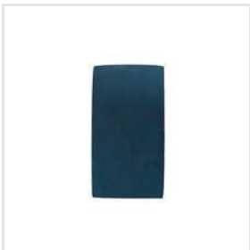
High Grade EVA Soft Pad