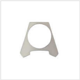
EVA Gasket Double Sided Tape