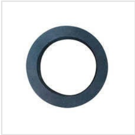
EVA Gasket Ring