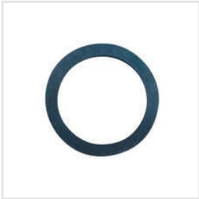
EVA Gasket Ring