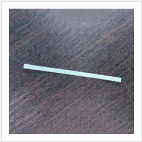
EPDM Foam Strip