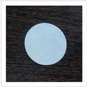
Double Sided Tape EVA Foam