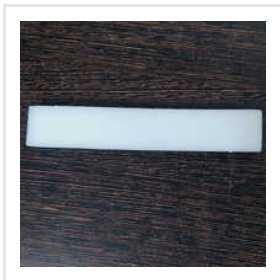
PU White Foam