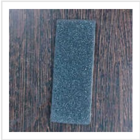
EVA Soft Pad