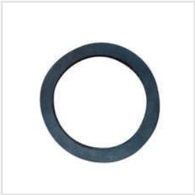
EVA Gasket Ring