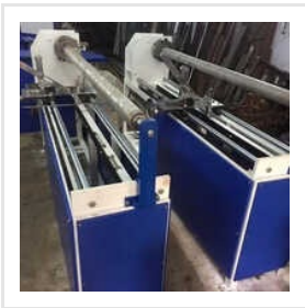
Tape Slicer Machine