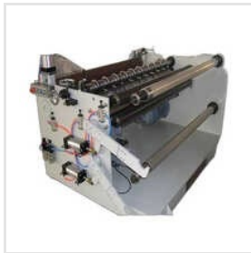
BOPP Tape Slitting Machine