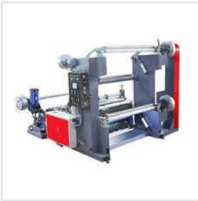
Slitting Rewinding Machine