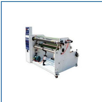
SINGLE SHAFT REWINDING MACHINE

4 Shafts Exchange Stationary Tape (Gitti Tape) Sli, BOPP Self Adhesive Tape Plant, Core Cutting Machine, Double Shaft Exchange Semi Auto Rewinder, Duplex Shaft Slicer Machine, Easy Tear Mini Slitting Rewinding Machine, Mini Rewinding Machine, Multi Purpose Coating Lamination Machine, PVC Insulation Tape Plant, Paper Core Loader (Fully Automatic), Rewinder Machine, Rotogravure Printing Machine, Rotogravure Printing Machines, Slicer Machine, Slicer Machine For glue tape, etc.