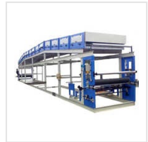
Industrial BOPP Coating Machine