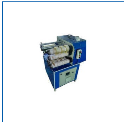
MINI SLITTING REWINDING MACHINE