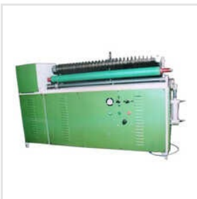
Industrial Tape Core Cutting Machine