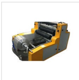
Mild Steel Rewinding Machine