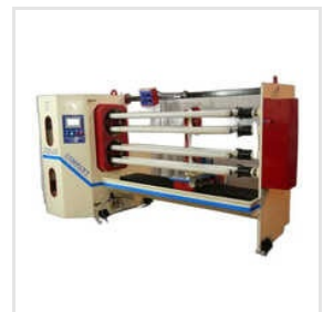
8 Shaft Slicer Machine