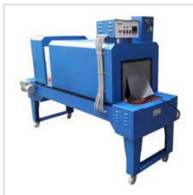
Industrial Shrink Packing Machine