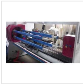
4 Shaft Tape Slicer Machine