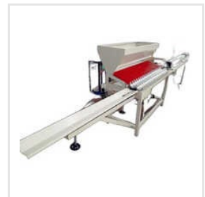
Automatic Paper Core Loader Machine