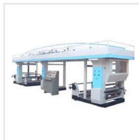
Automatic BOPP Self Adhesive Tape