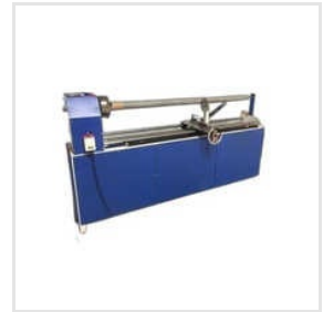
BOPP Tape Slicer Machine