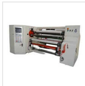
Double Shaft Automatic Rewinding