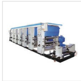
Automatic Rotogravure Printing