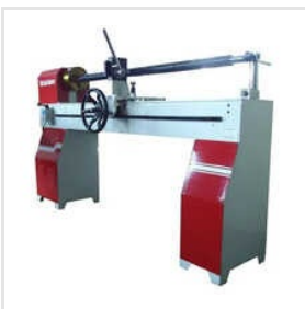
Log Rolls Tape Slicer Machine