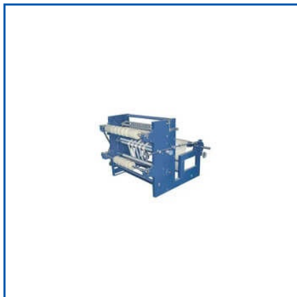
SEMI AUTOMATIC SLITTING REWINDING MACHINE