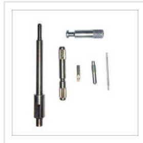
316L Ferrous Pin Type Turned Parts