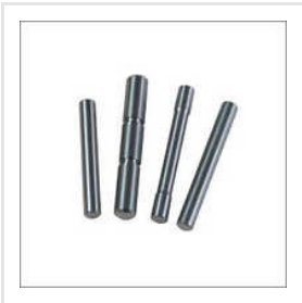
Plain Steel Pins