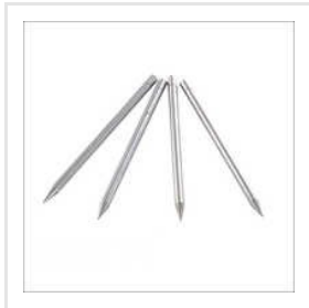
8 Mm Stainless Steel Pins