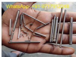
STAINLESS STEEL PINS

12 mm Steel Pins, 302 Stainless Steel Pins, 304L Ferrious Pin Type Turned Parts, 316L Ferrious Pin Type Turned Parts, 8 mm Stainless Steel Pins, Dowel pins, Knurled Steel Pins, Mild Steel Pins, Plain Steel Pins, SS Precision Turned Components, Small Steel Pins, Stainless Steel Dowel pins, Stainless Steel Knurled Pins, Stainless Steel Pins, Stainless Steel Precision Components, etc.