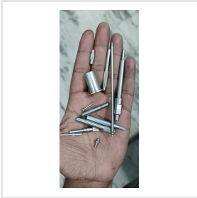
Stainless Steel Knurled Pins