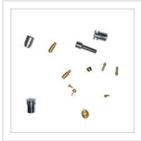
304L Ferrous Pin Type Turned Parts