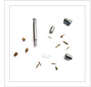
Small Steel Pins