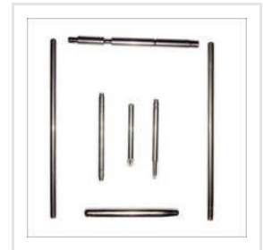
SS Precision Turned Components