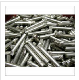
Knurled Steel Pins