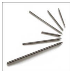
MILD STEEL PINS