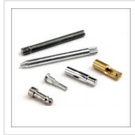
12 Mm Steel Pins