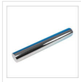
302 Stainless Steel Pins