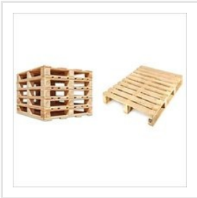
Industrial Wooden Pallets