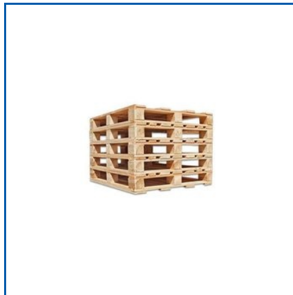
PINEWOOD HINGES PALLETS