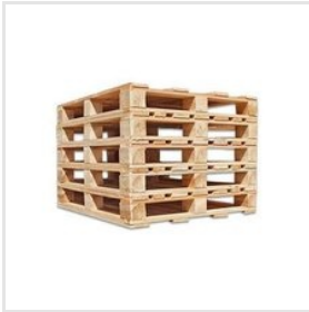
Pinewood Hinges Pallets