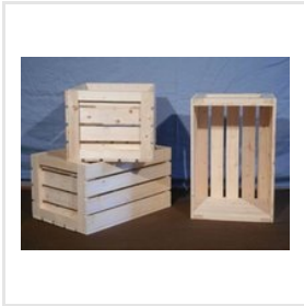
Pine Wooden Boxes