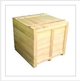
Hard Wood Packaging Boxes