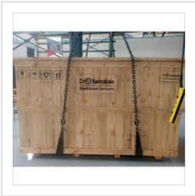
Wooden Packing Boxes