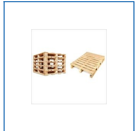
INDUSTRIAL WOODEN PALLETS