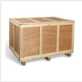
Plywood Packing Boxes