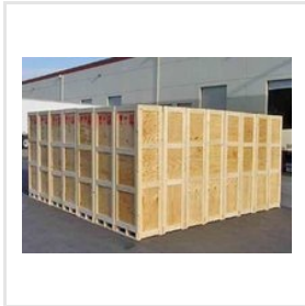
Industrial Plywood Boxes