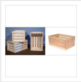
Customized Pine Wood Boxes