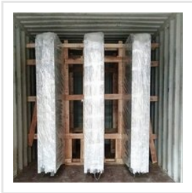
Granite Slab Packing Services