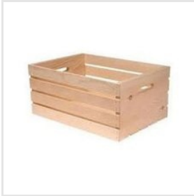
Pine Wood Packaging Boxes