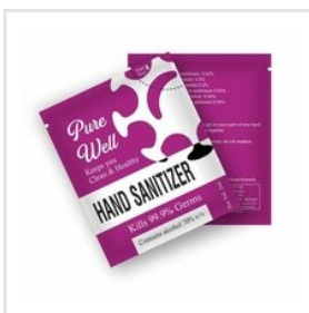
Hand Sanitizer Sachet