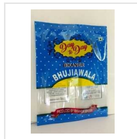
Flexible Laminated Poly Pouches