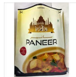
FROZEN FOOD POUCH