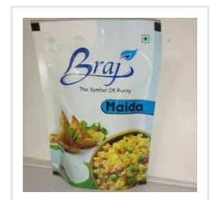
Laminated Poly Pouch