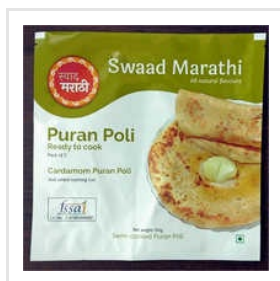
Food Packaging Pouch