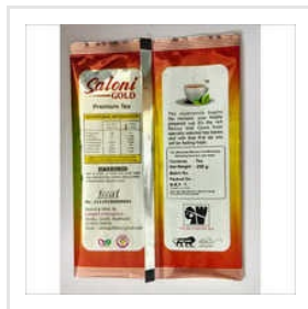
Center Seal Pouch