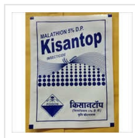
Printed Laminated Pouch