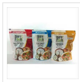
Food Grade Pouch