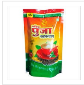
Printed Zipper Pouch