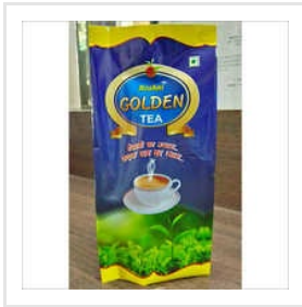
Poly Stand Pouches