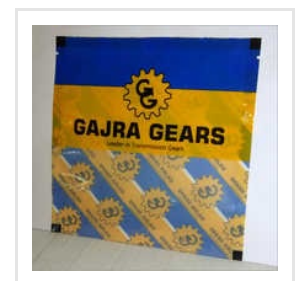
Plastic Packaging Pouch