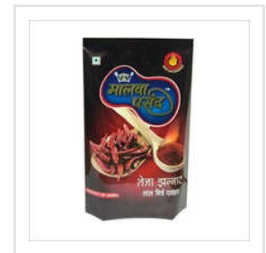
Standy Zipper Poly Pouch