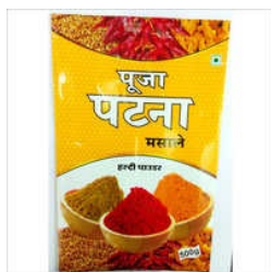
SPICE PACKAGING POUCH

Bottle Shape Pouches, Center Seal Pouch, Duplex Packaging Box, Duplex Paper Tea Packaging Box, Face Mask Pouch, Flexible Laminated Poly Pouches, Flexible Pouch, Food Grade Pouch, Food Packaging Pouch, Frozen Food Pouch, Frozen Sweet Corn Printed Pouch, Gravure Printed Pouch, Hand Gloves Box, Hand Sanitizer Pouch, Ice Cream Pouch, etc.