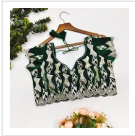
Fancy Fully Heavy Designed Blouse