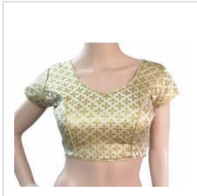
Ladies Jacquard Designer Blouse