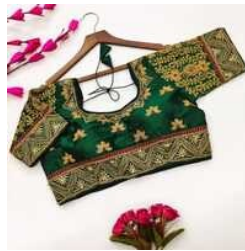
BEAUTIFULLY DESIGNED BLOUSES