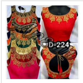
Fancy Embroidery Blouse