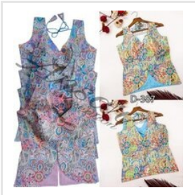
Long Length Blouses For Women