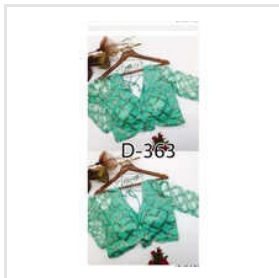
PARTY WEAR REDYMADE BLOUSE