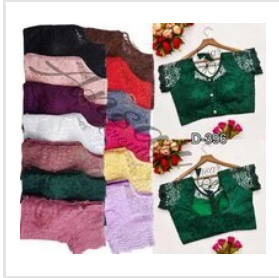
Net Designed Blouses For Women