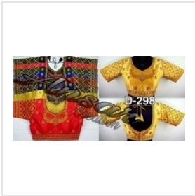
LADIES EMBROIDERY BLOUSE