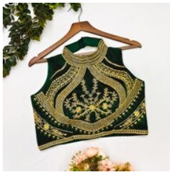
CHINA FABRIC BLOUSES FOR WOMEN

Ansar Creation Bollywood Style Blouses, Ansar Creation Fancy Blouse Collection, Ansar Creation Wedding Wear Blouses, Ansar Creation's Great Collection of Blouse, Beaded Blouse, Butterfly Pattern (Multy Color Imported Blouse), Etc.