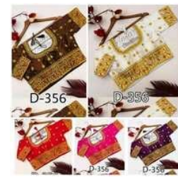
PHANTOM SILK DESIGNER BLOUSE