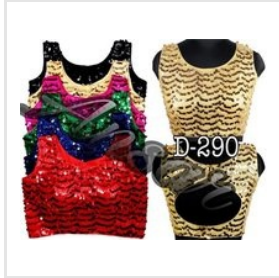
Designer Sequence Blouse