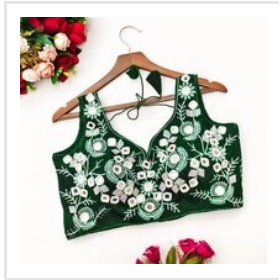
China Fabric Blouses