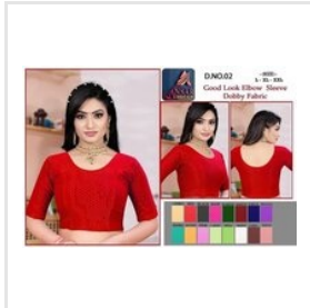
Stretchable Blouses For Women