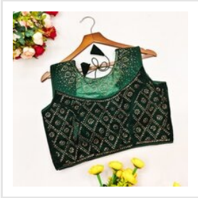
Velvet Blouses For Women