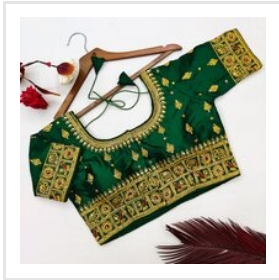
Fancy Designer Blouses