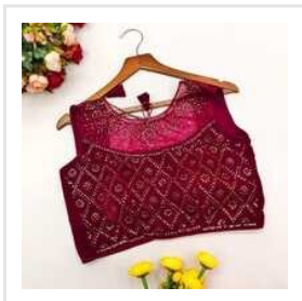
Ansar Creation Wedding Wear Blouses