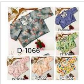
Designer Silk Printed Blouse