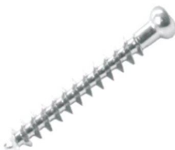
3.5 MM Cancellous Screws