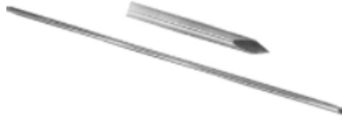
Kirschner Wire With Trocar Tip (Double Ended)