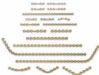
Mini Mandible Plate (With Center Space Straight)