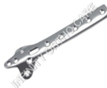
Clover Leaf Plates