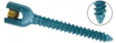
Mono Axial - Pedicle Screw (Titanium)