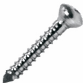
Standard Cortical Screw