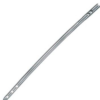
Interlocking Femoral Nail-standard