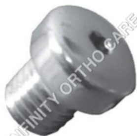
End Cap For Gamma Nail