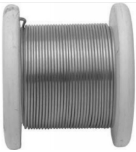
Stainless Steel Suture Wire- Standard Length Roll