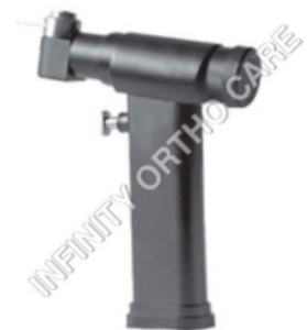
Battery Operated Oscillating Saw System (Black)