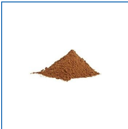
ZO TOX HERBA

17%EDTA LIQUID WITH CETRIMIDE, 4 PLY CARBON COATED FACE MASK, ARTICULATING PAPER, AUTOCLAVABLE BUR BOX, AUTOCLAVABLE CHEEK RETRACTOR WITH WINGS, AUTOCLAVABLE IMPRESSION TRAY, AUTOCLAVABLE IMPRESSION TRAYS , Aloe vera, Aqua Toxin Binder, BARRIER FILM DISPENSER , BOUFONT CAPS, BUR BOX , CAMPHOR MONOCHLOROPHENOL, CAVIARC - I, CHEEK RETRACTOR AUTOCLAVABLE SET OFF 2 , etc.