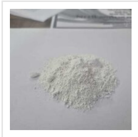
Mar O Mold