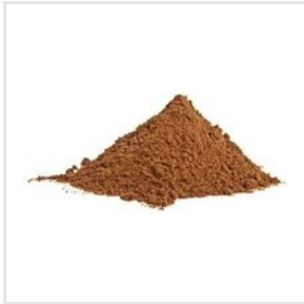
ZO TOX HERBA