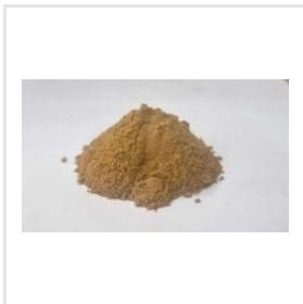
Toxin Binder Powder