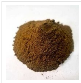
Toxocid Fresh And Final