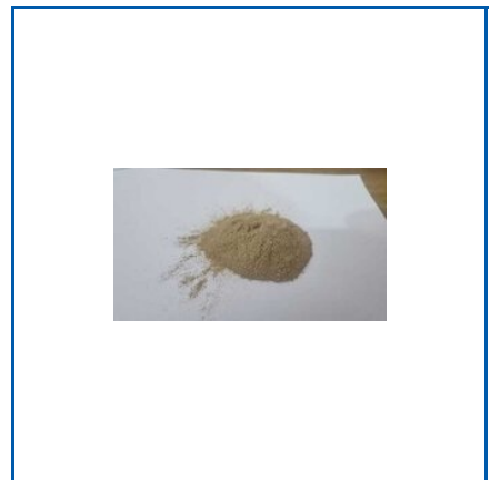
ZOBOUND TOXMOS ORGANIC BINDER