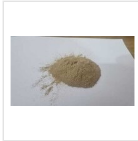
Zobound Toxmos Organic Binder