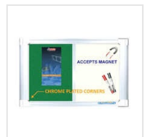
Chrome Plated Corner Combination Board