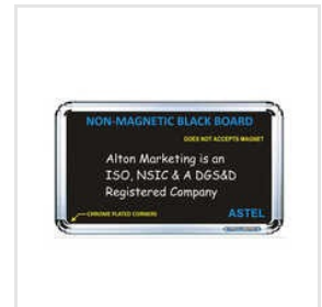
Non Magnetic Black Chalk Boards