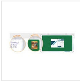
Fabric Pin Up Non Magnetic Board