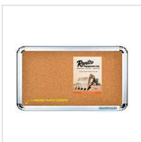
Cork Pin Up Notice Bulletin Boards