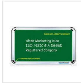
Non Magnetic Green Chalk Boards