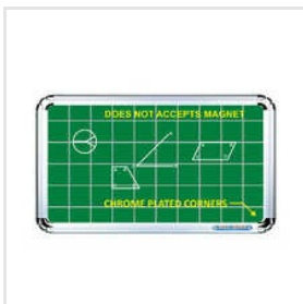
Green Non Magnetic Graph Boards