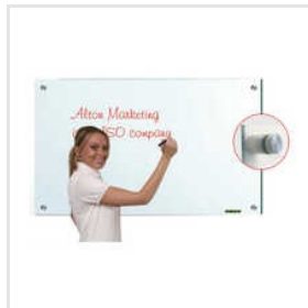
Modern Non Magnetic Glass Writing Boards