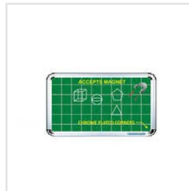
Magnetic Green Graph Boards