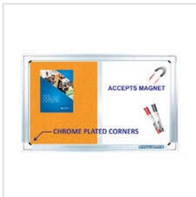
Fabric And Magnetic Combination Board