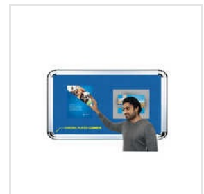
Felt Pin Up Notice Bulletin Boards