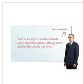
Modern Magnetic Glass Writing Boards