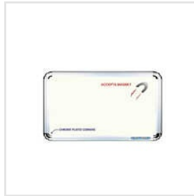
Non Magnetic White Marker Boards