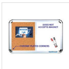
Cork And Non Magnetic Combination