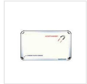
White Marker Magnetic Boards