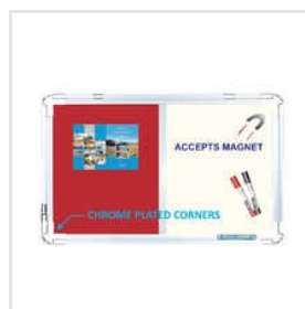
Felt And Ceramic Combination Board