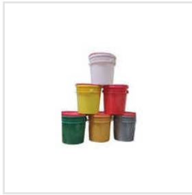
5 Kg Plastic Grease Container