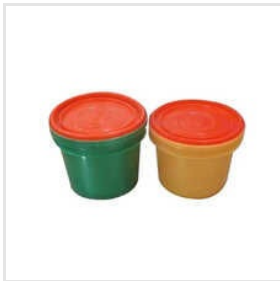
200 Gm Grese Bucket