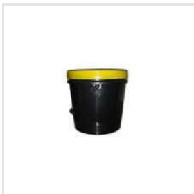
3kg Grease Bucket