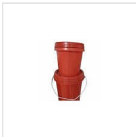
1 Kg PPCP Grese Bucket