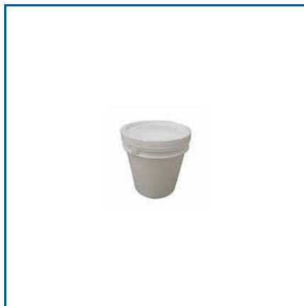
20L FERTILIZER BUCKET