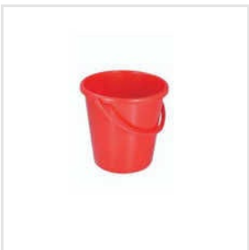
Plastic Round Buckets