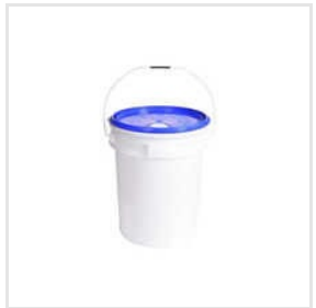
26 Litre Plastic Bucket