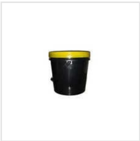
5 Kg Plastic Grease Storage Bucket