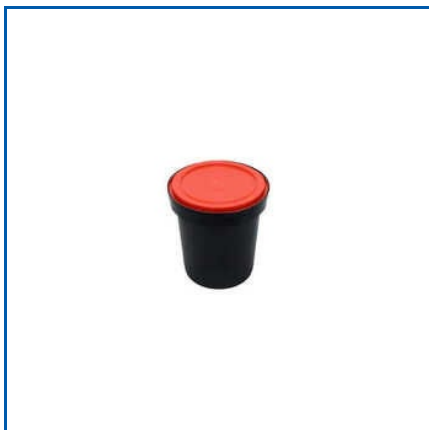
1 KG GREASE BUCKET

1 Kg Grease Black Container, 1 Kg Grease Bucket, 1 Kg Grease Straight Container, 1 Kg Hdpe Grease Jar, 1 Kg PPCP Grese Bucket, 1 Kg Round PPCP Container, 1 L Out Cap Grease Jar, 1-2 Kg Round Ppcp Container, 10 Kg Hdpe Grease Jar, 10 Kg Paint Bucket, 10 Kg Prestiside Bucket, 10 Kg Zyme Bucket, 10 L Paint Bucket, 10 Litre Oil Bucket, 10 Litre Printed Engine Oil Bucket, etc.