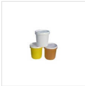
200 Grams Plastic Containers