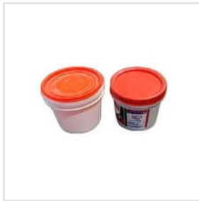
250 MI PPCP Grease Bucket