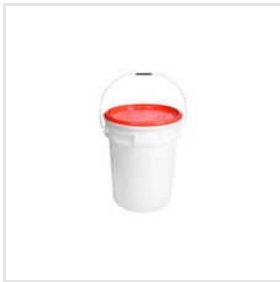
18 Kg Black Grease Bucket