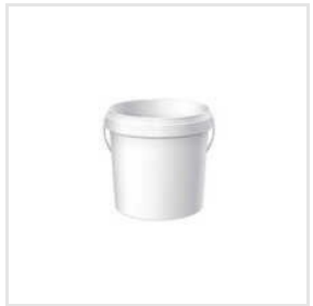
5 Kg White Grease Bucket