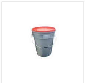
15 Kg Grese Bucket