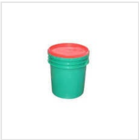
10 Litre Round Grease Bucket