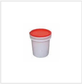
Out Cap Grease Container