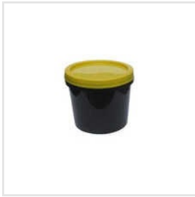
1 Kg Grease Black Container