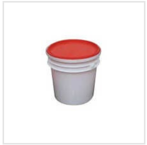
3 Kg Round Grease Bucket