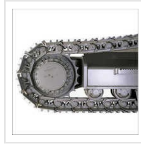
Mild Steel Earthmoving Undercarriage