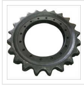
Mild Steel Sprockets For Earthmoving