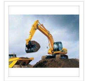
Cast Iron Excavator Attachments