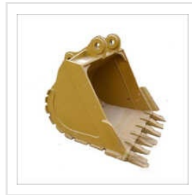
Iron Earthmoving Machine Bucket