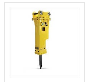
Mild Steel Rock Breaker Parts