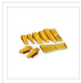
Mild Steel Job Side Cutters