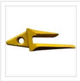
Steel Bucket Tooth Adapters