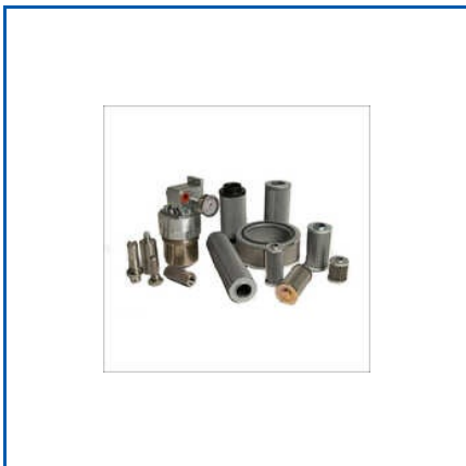
EARTHMOVING MACHINE FILTERS

6 Mtr Circular Honed Pipes, AFK001 Infrared Thermometer, Anti Vibration Rubber Pad, Automotive Rubber Gaskets, Cast Iron Bucket Tooth Bolt, Cast Iron Excavator Attachments, Cast Iron Hydraulic Pump, Chevron Packing Ring, Double Acting Hydraulic Cylinder, EN 24 Hard Chrome Plated Rods, Earthmoving Machine Filters, Earthmoving Machine Hydraulic Pump, Excavator Track Adjuster Assemblies, Excavator Undercarriage Track Roller, Excavators Bucket Teeth, etc.