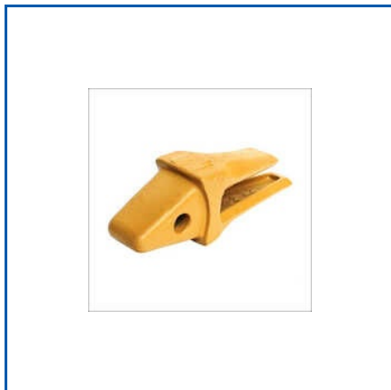
MILD STEEL EXCAVATOR TOOTH ADAPTER