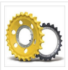
Mild Steel Excavator Sprocket