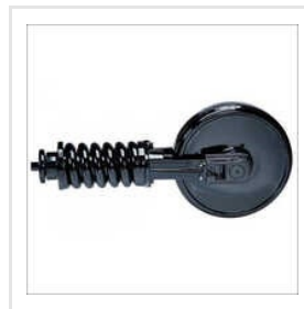
Excavator Track Adjuster Assemblies