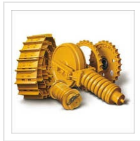
Mild Steel Excavators Front Idler