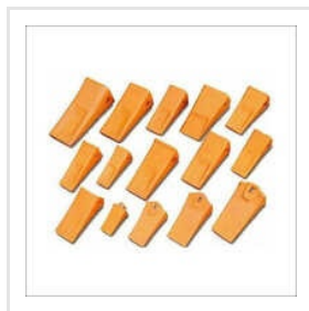
Excavators Bucket Teeth