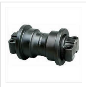
Excavator Undercarriage Track