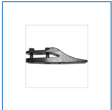
CAST IRON BUCKET TOOTH BOLT