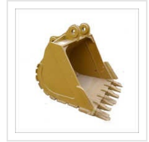
Industrial Excavator Bucket