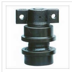
Mild Steel Excavators Carrier Roller