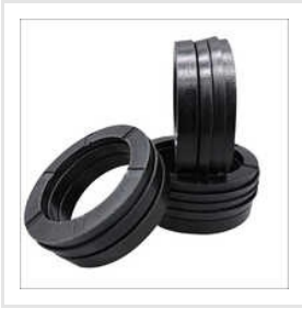
Chevron Packing Ring