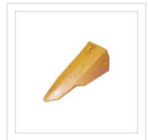
Mild Steel Ripper Tooth