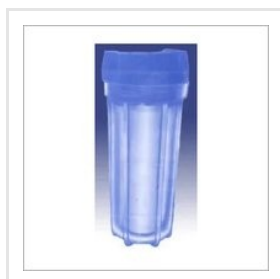
Super Swan Micro Filter