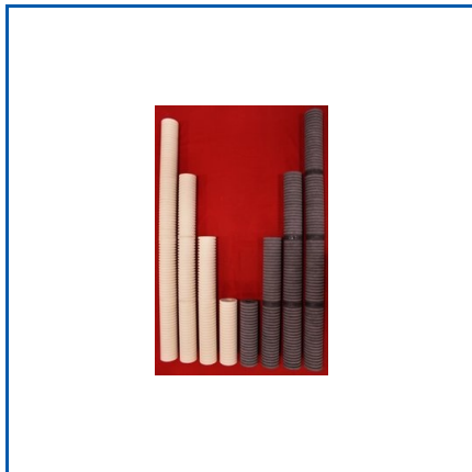
CELLULOSE FILTER CARTRIDGE