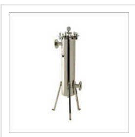
Bag Filter Systems