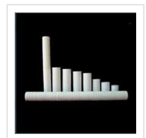
Grooved Filter Cartridge