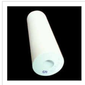
RO Filter Cartridge