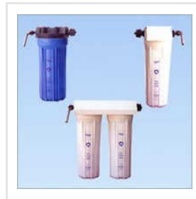
Domestic Purpose Micron Filters