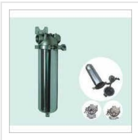
Cartridge Filter Systems