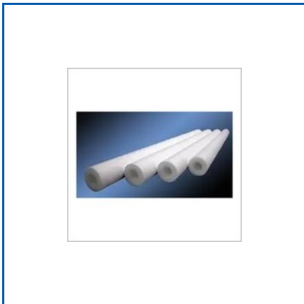
UNGROOVED FILTER CARTRIDGE

Bag Filter Systems, Cartridge Filter Systems, Cellulose Filter Cartridge, Domestic Purpose Micron Filters, Filter Bags, Grooved Cartridges, Grooved Filter Cartridge, Hydraulic Oil Filter, Meltblown Filter Cartridges for Water Filter, Multiple Filter Units, Oil Filter Cartridges, etc.