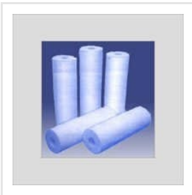
Resin Bonded Filter Cartridges