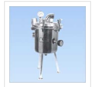
Multiple Filter Units