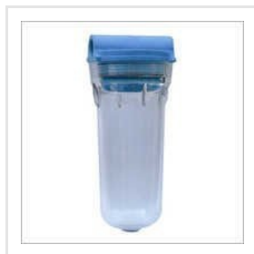
Transparent Single Filter Bottom Unit