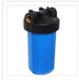
Single Cartridge Housing