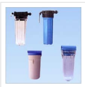
Single Filter Units