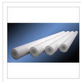
Meltblown Filter Cartridges For Water