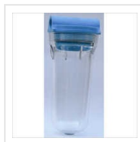
Transparent Filter Housing