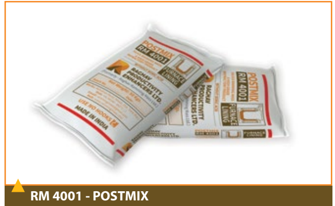
RM 4001 - POSTMIX