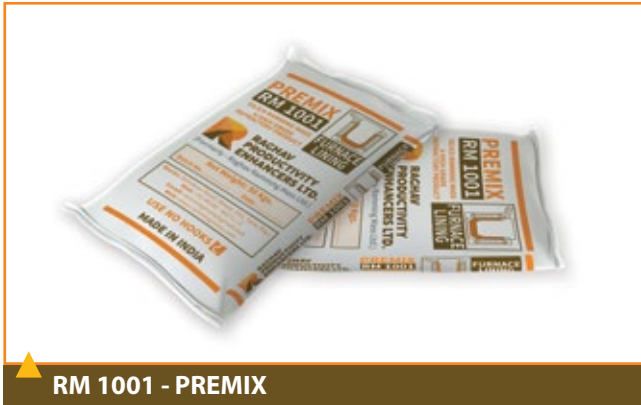
RM 1001 - PREMIX