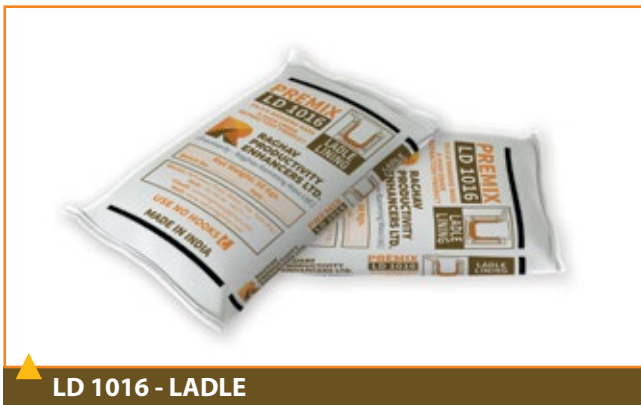
LD 1016 - LADLE