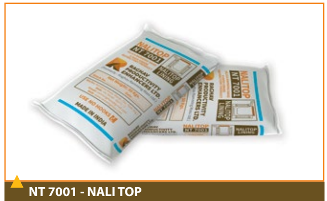
NT 7001 - NALI TOP