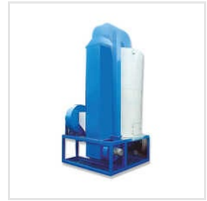
Industrial Dryer Furnace Machine