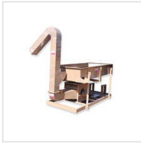
Horizontal Fan Chalna Machine