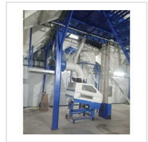
Vacuum Destoner Machine