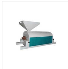
Industrial Emery Roll Machine