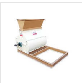
Industrial Hammer Mill