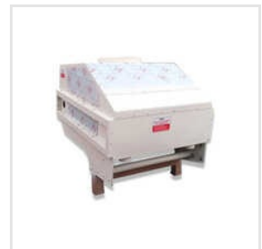
Industrial Vacuum Destoner Machine