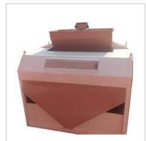
Magnetic Destoner Machine