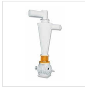
Industrial Cyclone Machine