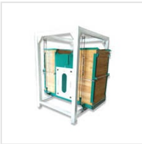
Industrial Plan Shifter Machine