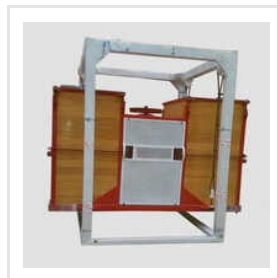
Industrial Electric Plan Shifter Machine