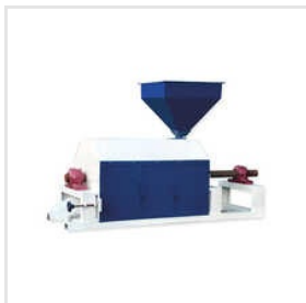
Electric Emery Roll Machine