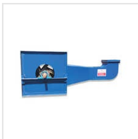
Industrial Box Blower