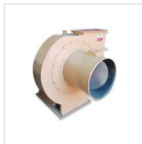
Industrial Electric Blower