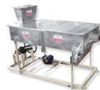
HORIZONTAL CHALNA MACHINE