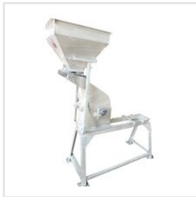
Industrial Pulverizer Machine