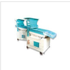
Industrial Destoner Machine