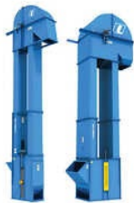
ELECTRIC BUCKET ELEVATOR

Electric Bucket Elevator, Electric Emery Roll Machine, Horizontal Chalna Machine, Horizontal Fan Chalna Machine, Industrial Box Blower, Industrial Bucket Elevator, Industrial Cyclone Machine, Industrial Destoner Machine, Industrial Dryer Furnace Machine, Industrial Electric Blower, Industrial Electric Plan Shifter Machine, Industrial Emery Roll Machine, Industrial Hammer Mill, Industrial Iron Vibro Separator, Industrial Plan Shifter Machine, etc.