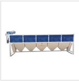
Industrial Reel Chalna Machine