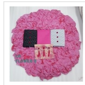
Ladies Printed Suit Dress Material