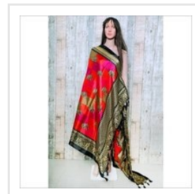
New Fancy Designs Cotton Blend Dupatta