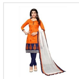
Cotton Dress Material