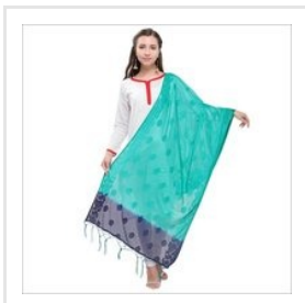
Fancy Silk Dupatta With Jhalar