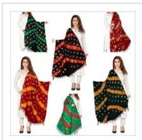
Designer Bandhej Pure Cotton Dupatta With