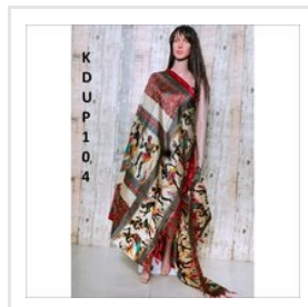
Boho Style Cotton Blend Printed Dupatta