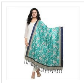
Printed Dupatta With Jhalar/ Tessals