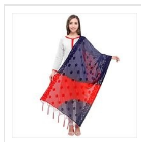
Casual Wear Dupatta With Jhalar/ Tessals