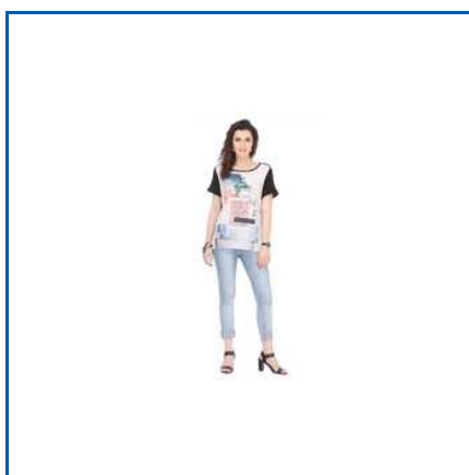
PRINTED CASUAL TOP