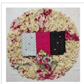
Suit Dress Material