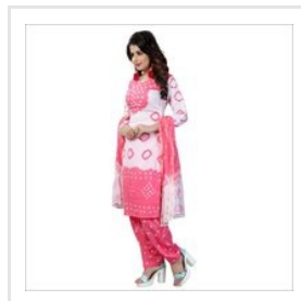
Pure Cotton Bandhani Dress Material