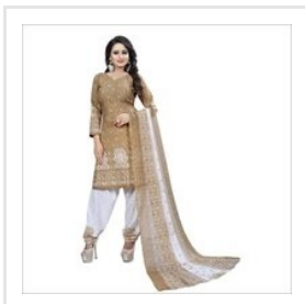
French Crepe Dress Material For Ladies