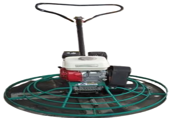
DMR1000 TECHNICAL SPECIFICATION