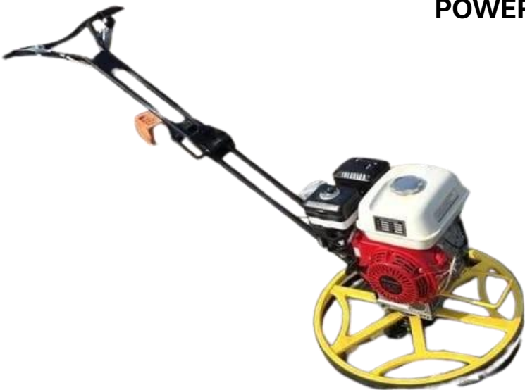
DMR900 TECHNICAL SPECIFICATION