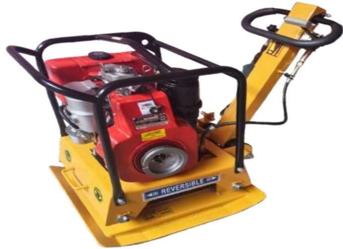
PLATE COMPACTOR C90T TECHNICAL SPECIFICATION