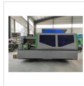
PVC Edge Bander Machine