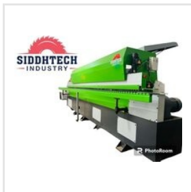
Automatic Edge Bander With Corner