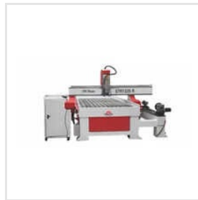
CNC Servo 3D Wood Router Machine