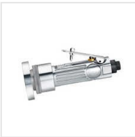
PVC Edge Banding Trimmer Machine