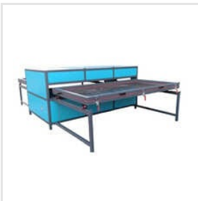
Door Vacuum Press Machine