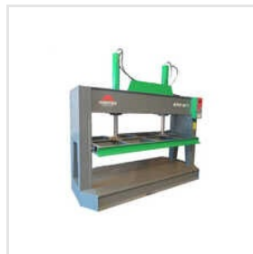
Plywood Laminate Cold Pressing Machine