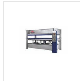
120Ton Automatic Hot Press Machine