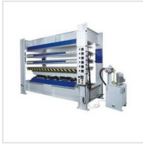
Automatic Hot Press Machine