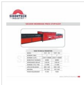
Vaccum Press Machine Double Trolley