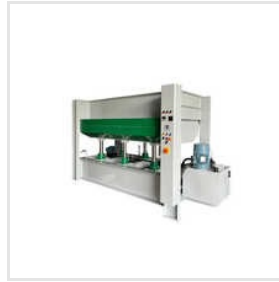
Hydraulic Hot Press Machine