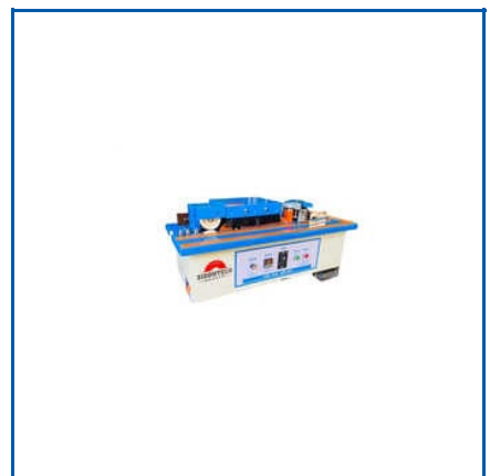
STEB - 04 MODULAR FURNITURE MACHINE SEMI EDGE BANDER WITH TRIMMER