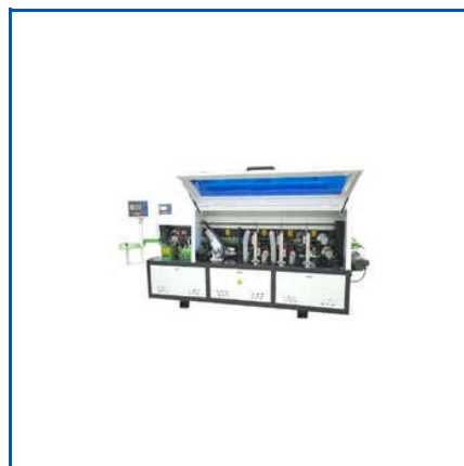
PVC EDGE BANDING MACHINE