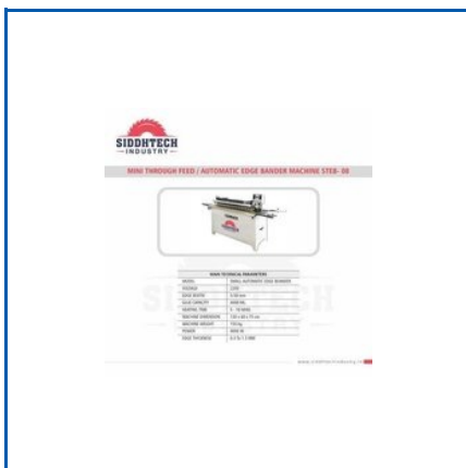
SMALL AUTOMATIC EDGE BANDER

120Ton Automatic Hot Press Machine, Automatic Edge Bander Machine With Corner Rounding, Automatic Edge Bander With Corner Rounding, Automatic Hot Press Machine, CNC Servo 3D Wood Router Machine, CNC Sliding Panel Saw, etc.