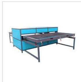
Vacuum Membrane Press Machine