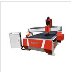
Industrial CNC Engraving Machine