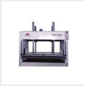
Hydraulic Cold Pressing Machine