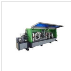
Automatic Edge Bander Machine With