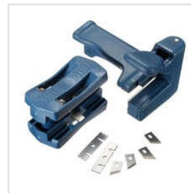
PVC Edge Banding Trimmer Machine