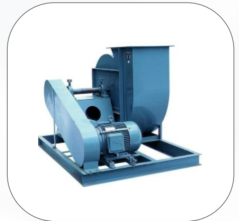
High Pressure Centrifugal Blower