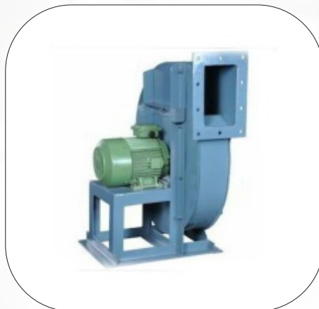
Centrifugal Exhaust Blower