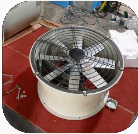
Industrial Axial Flow Fan