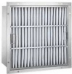
HDPE Pre Air Filter