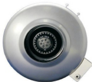
220 V Circular Inline Fan