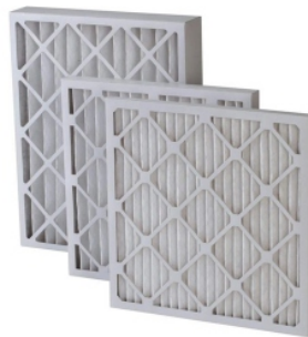
Air Pre Filter White