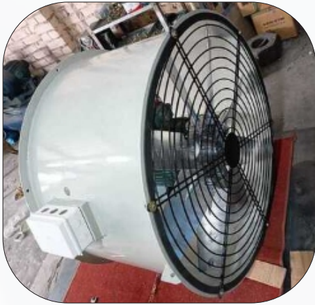
Axial Flow Fan