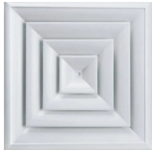
Square Ceiling Air Diffuser