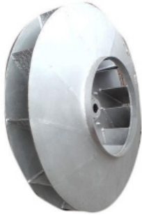
Round ID Fan Impeller