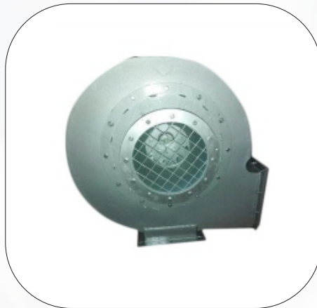
220 V Centrifugal Exhaust Blower