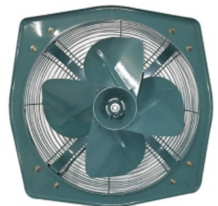
Wall Mounted Propeller Fan