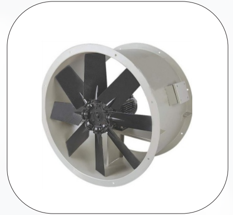
220V Axial Flow Fan