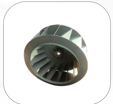
Stainless Steel ID Fan Impeller