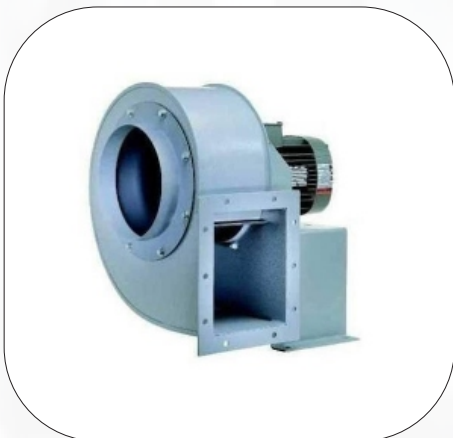
Industrial Centrifugal Blower