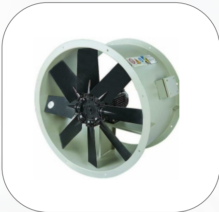
Tube Axial Flow Fan