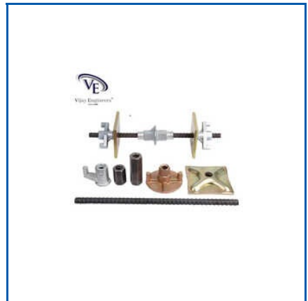
TIE ROD WING NUT IN TURKEY