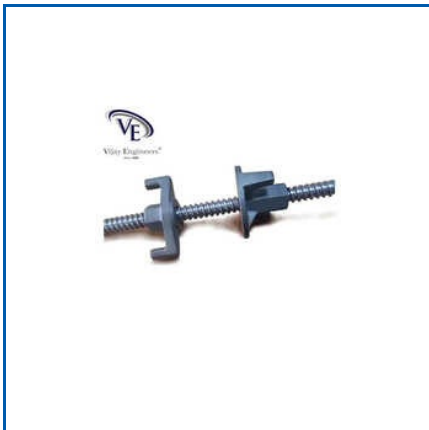
TIE ROD WING NUT IN GHANA

12mm 16mm 20mm Tie Rod, 16 mm Diameter MS Tie Rod, 16mm Tie Rod, 16mm Wing Nut, 20mm Anchor Nut, 20mm Scaffolding Anchor Nut, 20mm Tie Rod, 20mm Tie Rods, 3 Meter Tie Rod, 3 Wing Anchor Nut, Adjustable Base Jack, Adjustable Base and U Jack, Adjustable Steel Props, Adjustable U Jack, Anchor Nut In Chennai, etc.