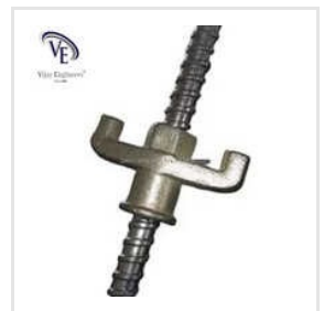
Tie Rod 16Mm