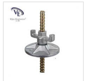
Tie Rod Wing Nut Eriter