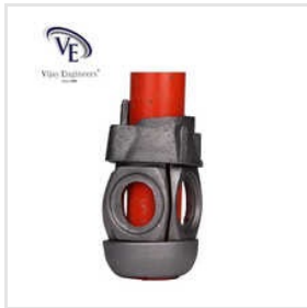
Scaffolding Top Cup