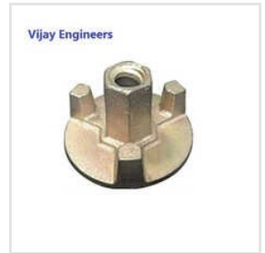
Scaffolding Anchor Nut