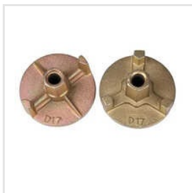
Anchor Nut In Jaipur