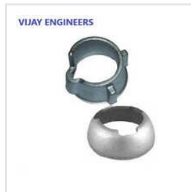
Top Cup Bottom Cup