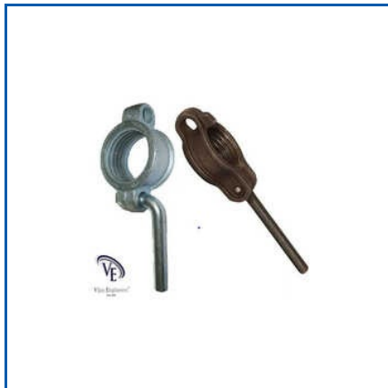
SCAFFOLDING PROP SLEEVE