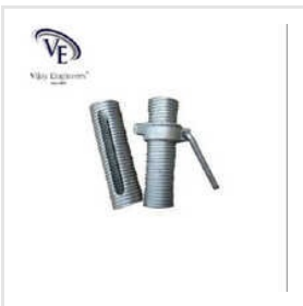
Props Sleeve With Props Nut