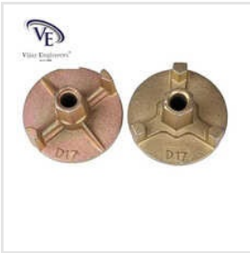
Tie Rod Anchor Nut