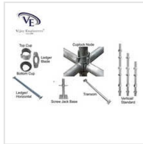
Top Cup Scaffolding