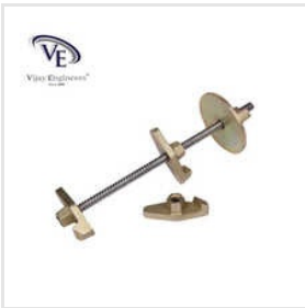
Tie Rod In Pune