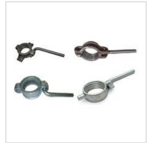
Prop Nut With Handle