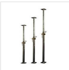
Adjustable Steel Props