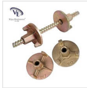
Anchor Nut In Kolhapur