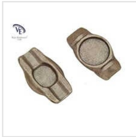
Forged Ledger Blade