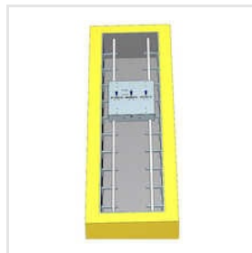
Under Body Car Washing Plant