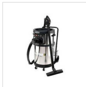
GV Etna4000 Steam Foam Vacuum