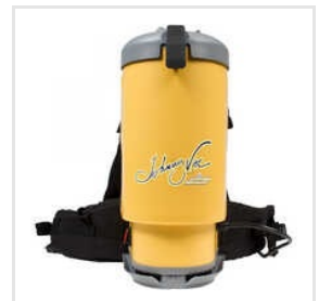
Backpack Vacuum Cleaner