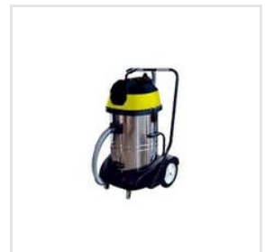
VC800 Vaccum Cleaner