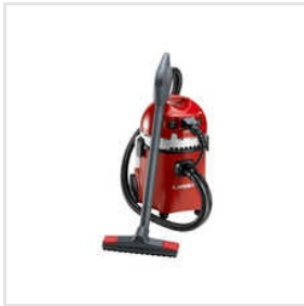
Multiper 4 Steam Foam Vacuum Cleaners