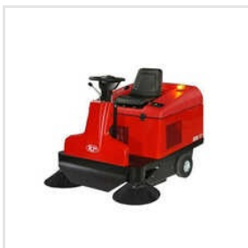
Atom Plus E Sweeper