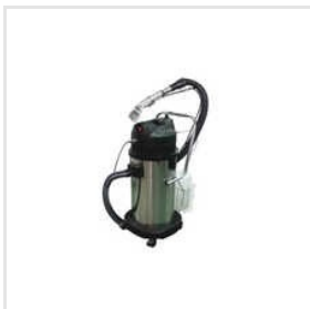
Alva 40 40 Ltr Upholstery Vacuum