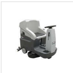
SCL Comfort XXS 66 Ride On Scrubbers