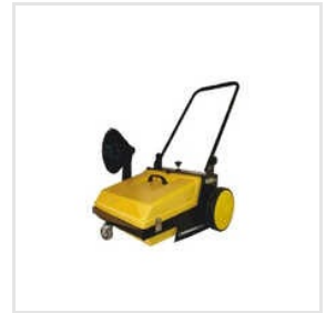
40 Ltr Manual Sweeper