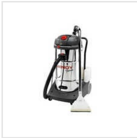
Windy Foam 65 Ltr Upholstery Vacuum