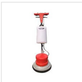
Single Disk Scrubbing Machine