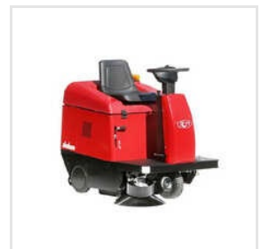
Slalom E Sweeper