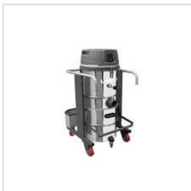
SMX 77 2 24 Industrial Vacuum Cleaners