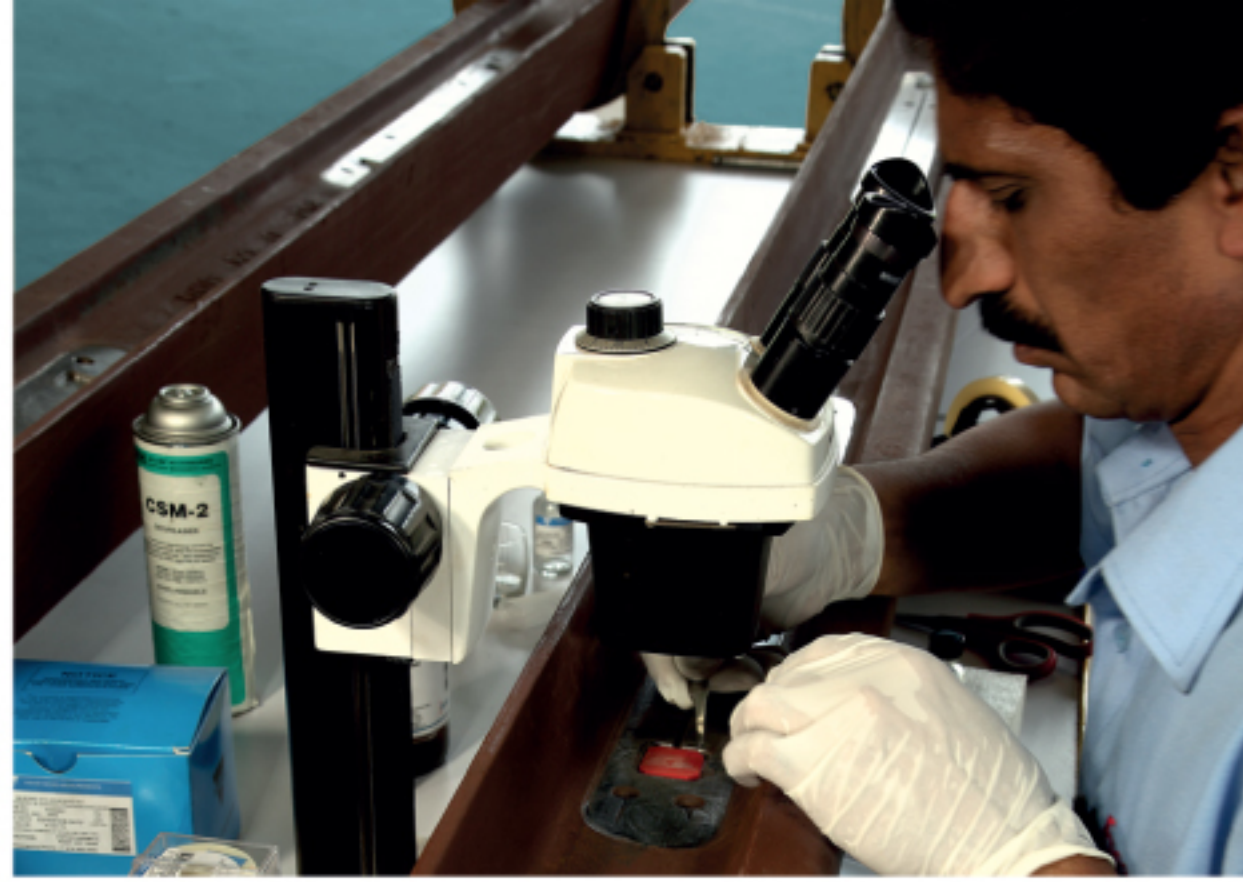
Precision bonding of strain gauges