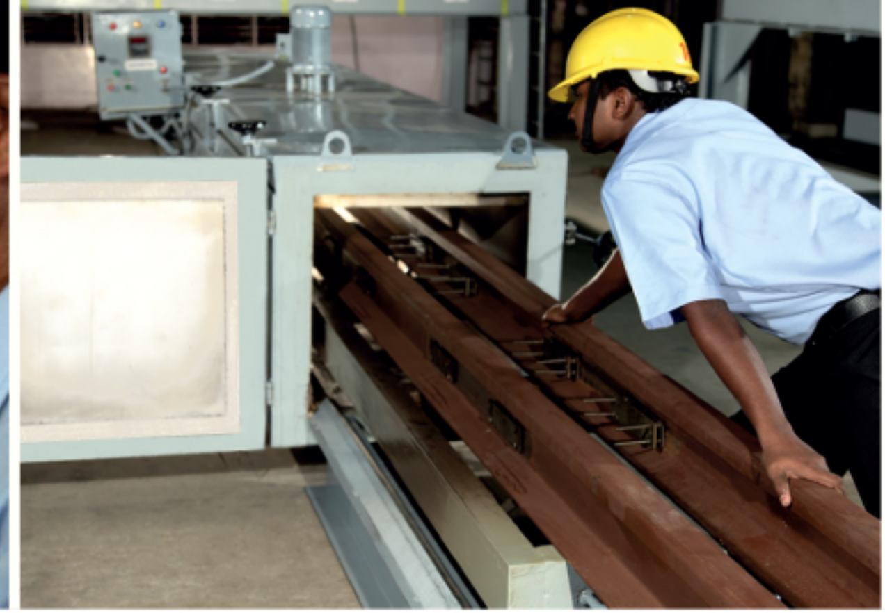
High Temperature Curing