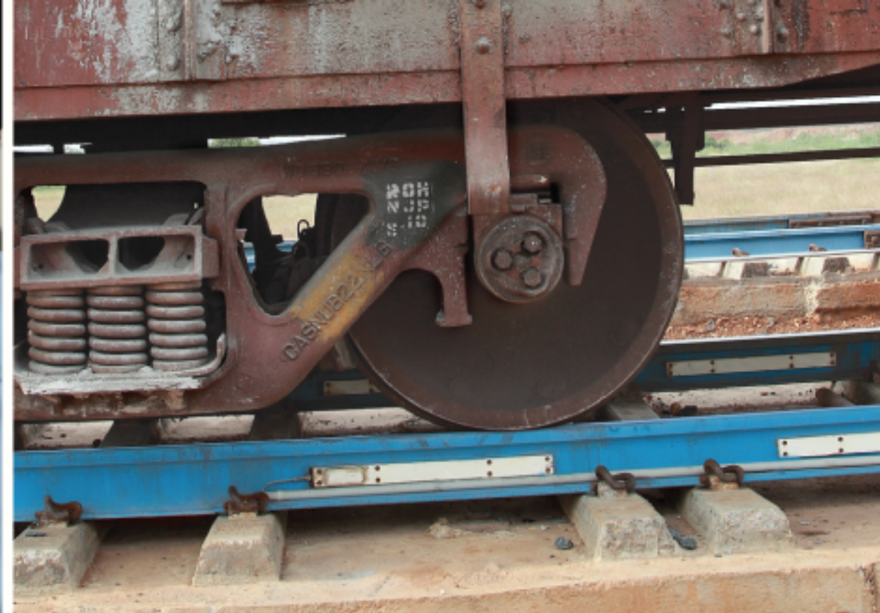
Rail Weigh-In-Motion - Rail Scale