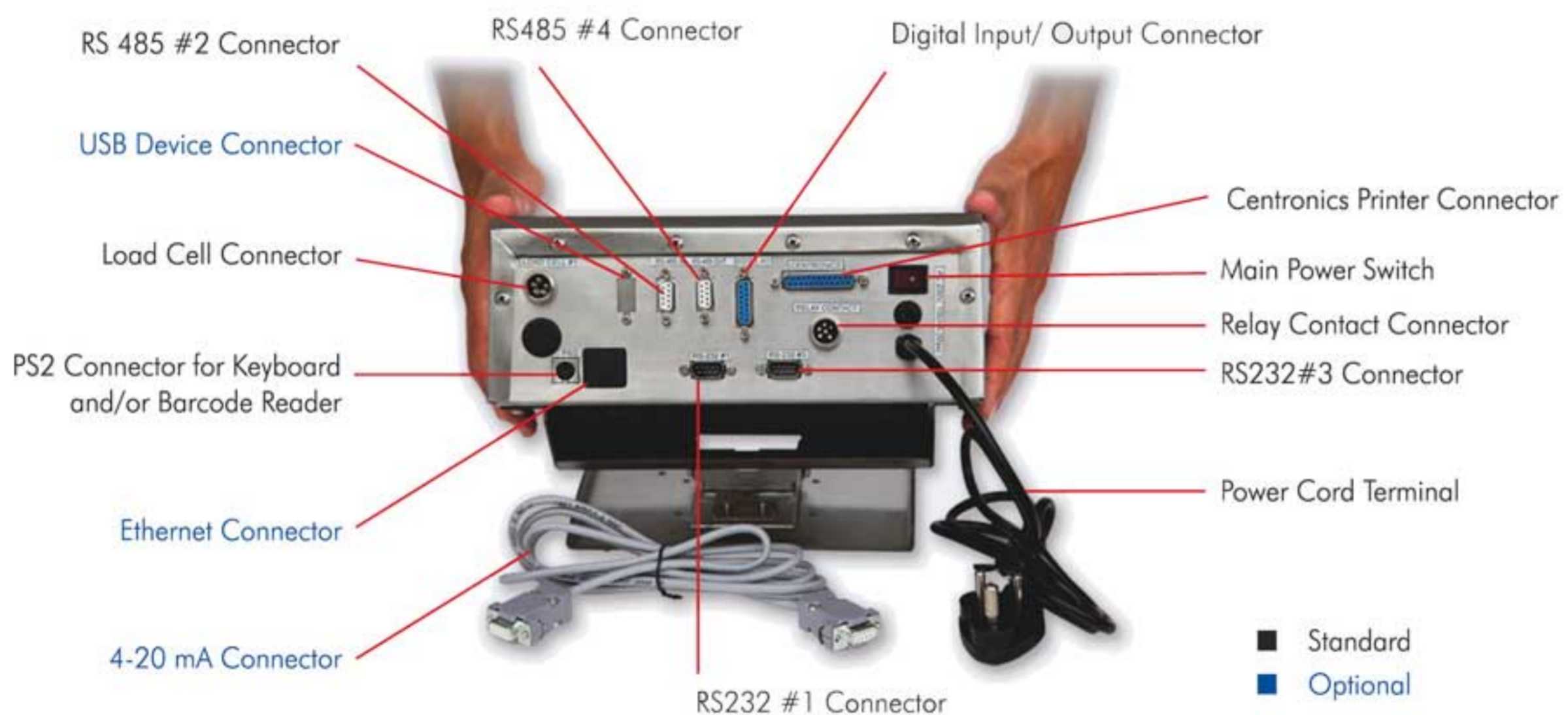
Rear view of Truck Master 960

If desired, the indicator can also be connected to the computer and in that case user friendly WeighSoft Enterprise Application Software enables to capture weight data, print weight tickets and reports. It also stores the weight data for future processing and reporting.