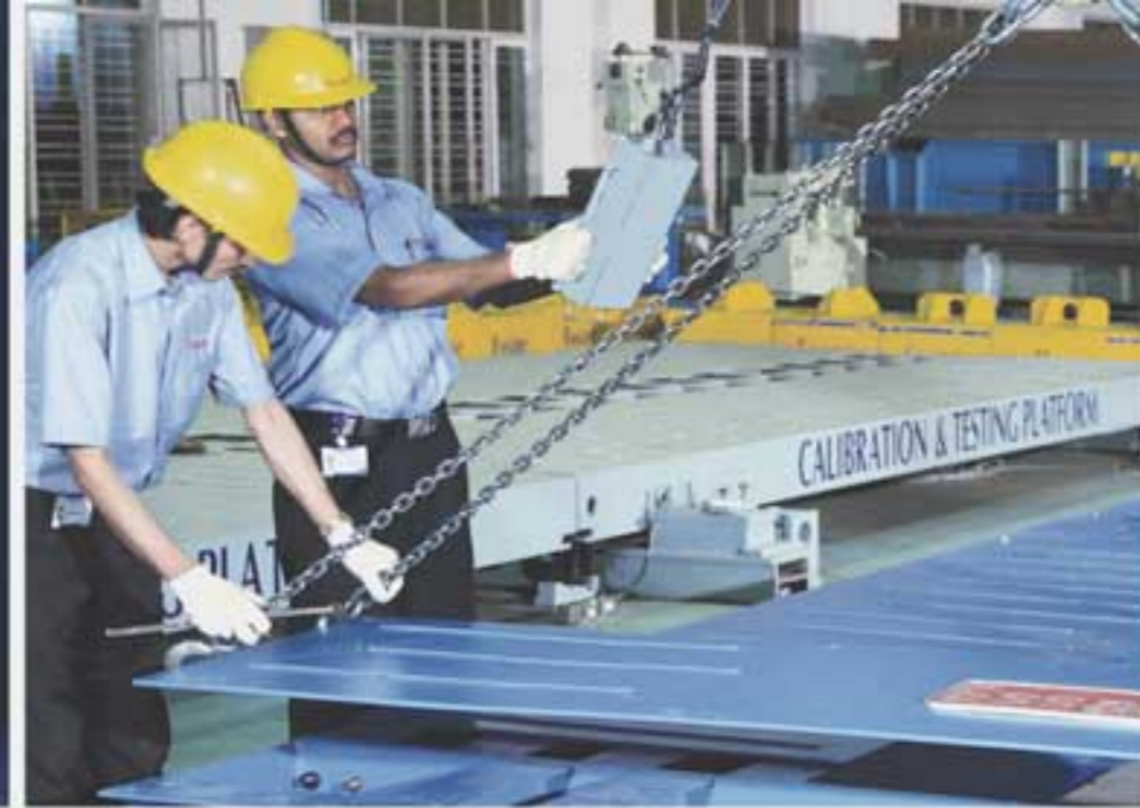
Assembly before despatch