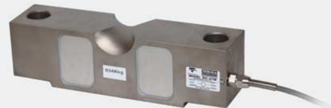
Double ended shear beam load cells