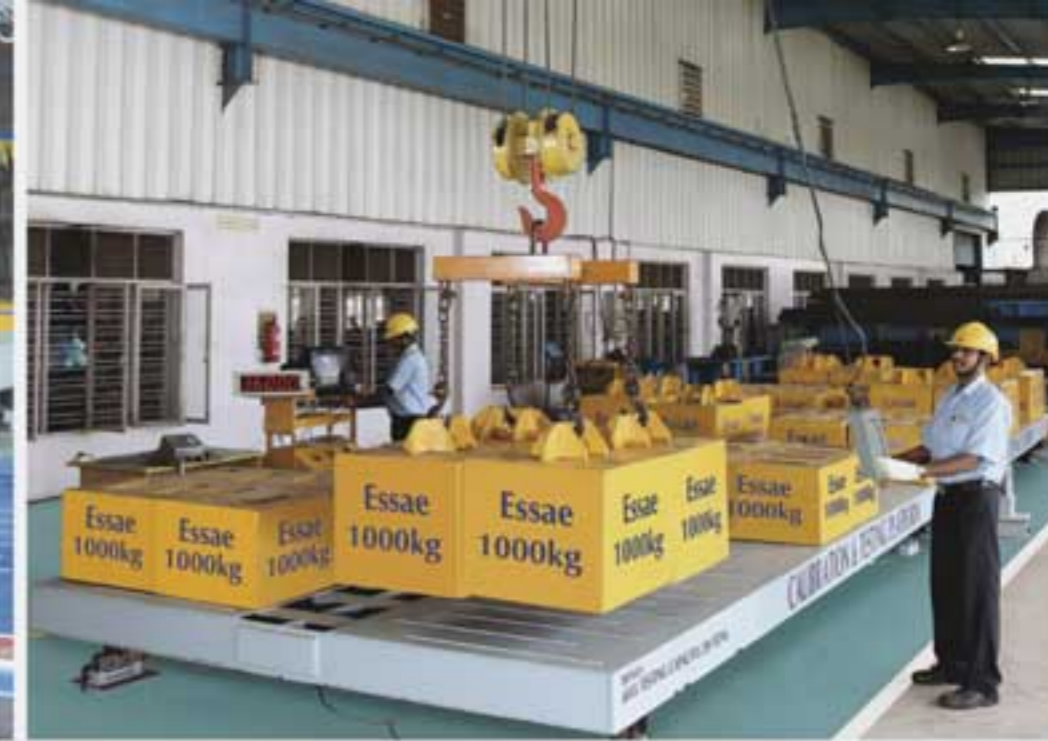
Full capacity Calibration Testing of Load Cells