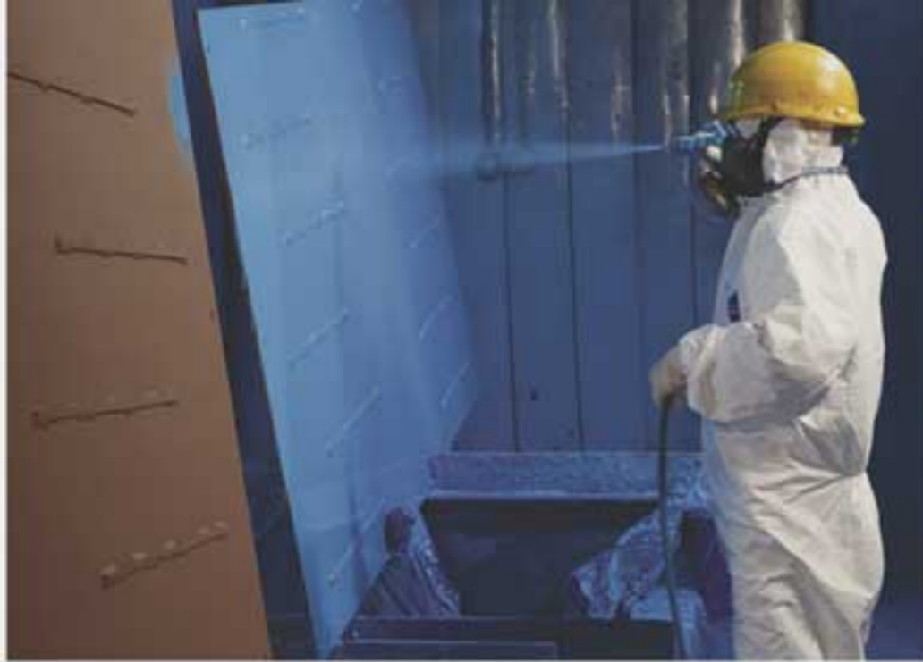
Protective Coating & Epoxy Finishing