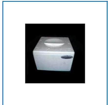
8 LTRS THERMOCOL MEDICINE BOXES