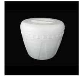
Apple Box 8 Litres