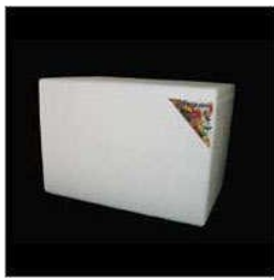
120 Litres Box