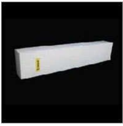
Airiator Floats For Aquaculture Farms