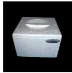
Thermocole Eps Box