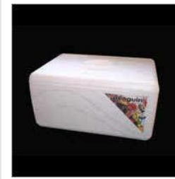
EPS Thermocol Packing Boxes