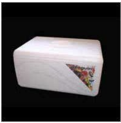
32 Litres Box