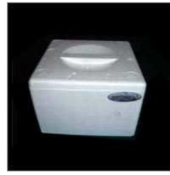
8 Ltrs Thermocol Medicine Boxes