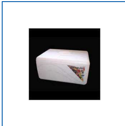
EPS THERMOCOL PACKING BOXES