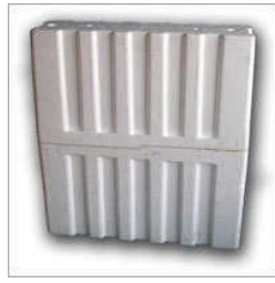
Thermocol Bubble Packing Materials