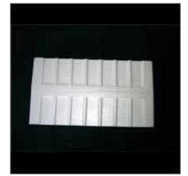
Thermocol Packaging Frames