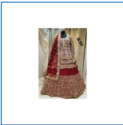
DESIGNER BRIDAL LEHENGA

Bridal Lehenga, Designer Bridal Lehenga, Designer Lehenga, Designer Wedding Lehenga, Designer Wedding Sarees, Embroidered Bridal Lehengas, Embroidered Kali Lehengas, Fancy Bridal Lehenga, Fancy Wedding Lehengas, Kali Lehenga, Traditional Wedding Lehenga, Wedding Dress, Wedding Lehenga, Zardozi Kali Lehengas, etc.