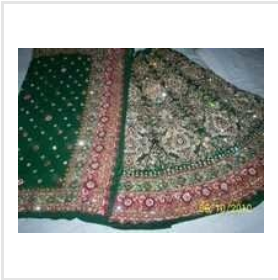
Embroidered Kali Lehengas