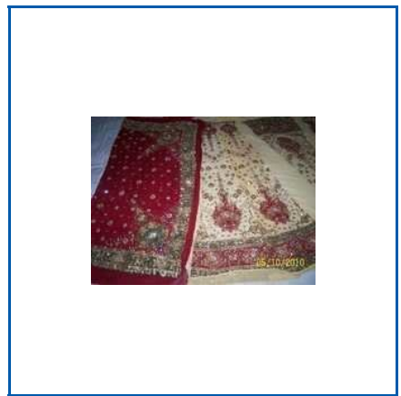
ZARDOZI KALI LEHANGAS