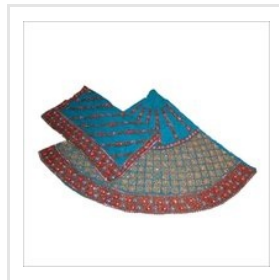
Fancy Wedding Lehengas