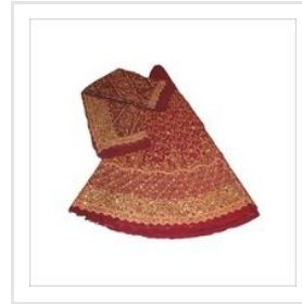
Traditional Wedding Lehenga