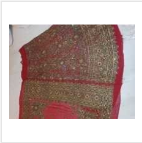
Designer Wedding Sarees