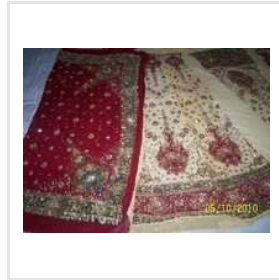
Zardozi Kali Lehengas