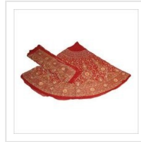
Designer Wedding Lehenga