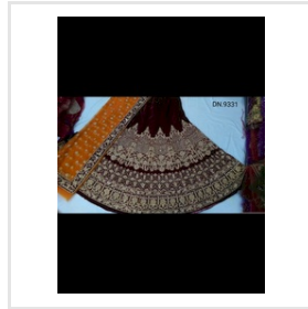
Fancy Bridal Lehenga