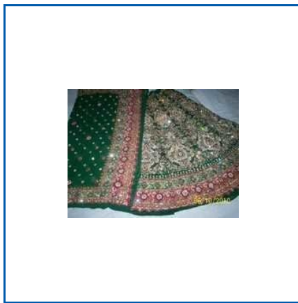
EMBROIDERED KALI LEHENGAS