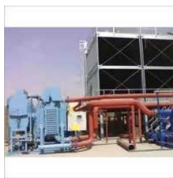
BOILER COMMISSIONING SERVICES