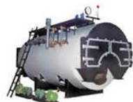
IBR Steam Boilers Consultant