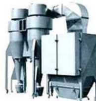
Multi Cyclone Dust Collector Consultant