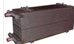
Industrial Heat Exchangers Consultant