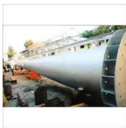
CHIMNEY FABRICATION SERVICE

Bag Filtration System Consultant, Boiler Commissioning Services, Boiler Plate Pipe Tubes Consultant, Boiler Valves Fittings Consultant, Chimney Fabrication Service, Fabricated Air Receiver Consultant, Flue Gas Chimney Consultant, IBR Steam Boilers Consultant, Industrial Compressed Air Receiver Consultant, Industrial Heat Exchangers Consultant, etc.