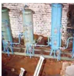
Fabricated Air Receiver Consultant