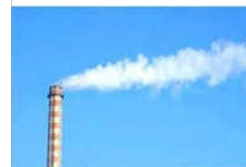
Industrial Smoke Chimney Consultancy