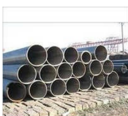
Boiler Plate Pipe Tubes Consultant