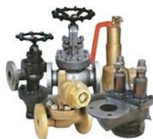
Boiler Valves Fittings Consultant