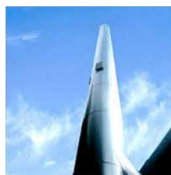
Flue Gas Chimney Consultant