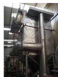
Bag Filtration System Consultant