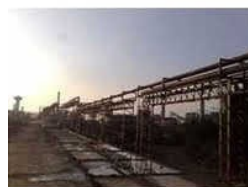
Steam Pipeline Fabrication Services