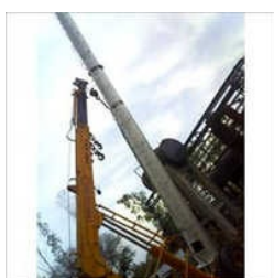
Rope Supported Chimney Consultants