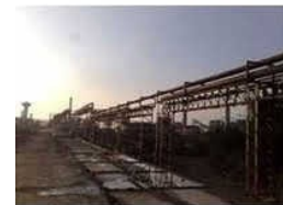
STEAM PIPELINE FABRICATION SERVICES