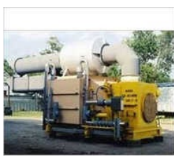
Waste Heat Recovery Unit Consultant