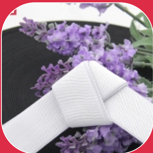
32mm Woven Elastic Tape