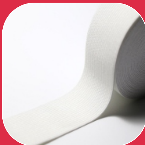
50mm Polyester Elastic Tape