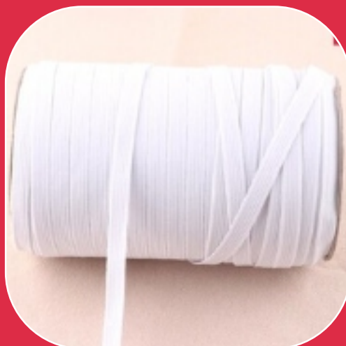
12mm White Woven Elastic Tape