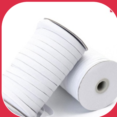
8mm White Woven Elastic Tape