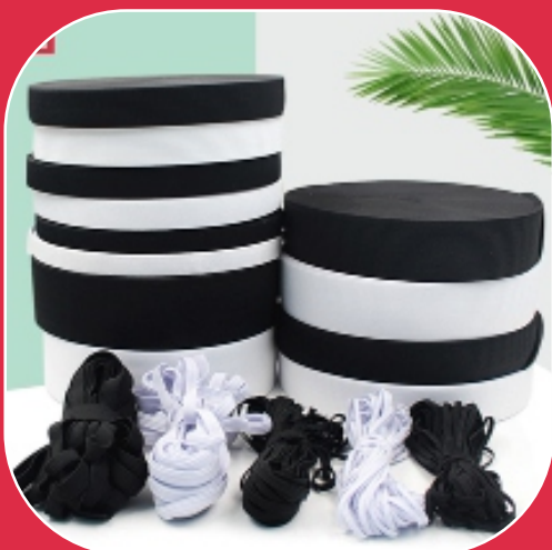
18mm Black Woven Elastic Tape