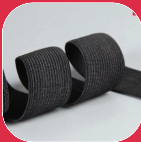
1 Inch Knitted Elastic Tape