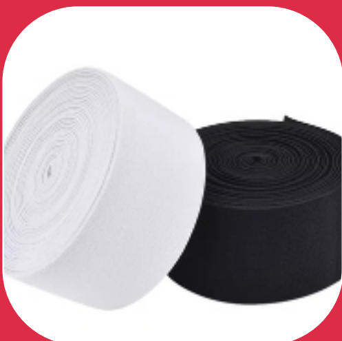
3 Inch Polyester Knitted Elastic Tape