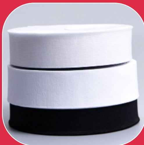
1.50 Inch Knitted Elastic Tape