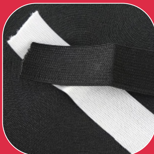
1.25 Inch Knitted Elastic Tape