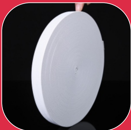
30mm Polyester Elastic Tape