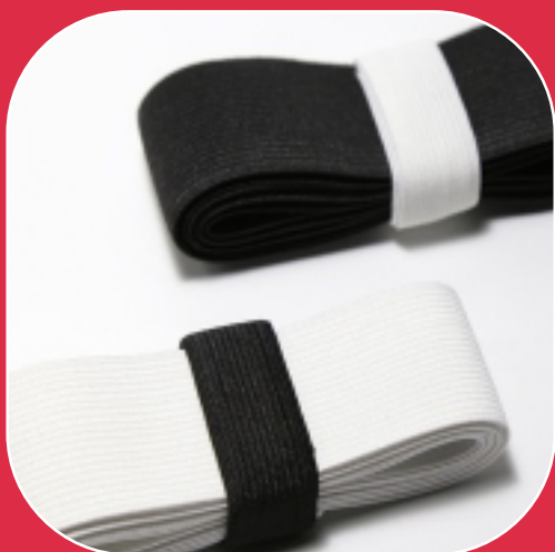
Crochet Polyester Knitted Elastic Tape