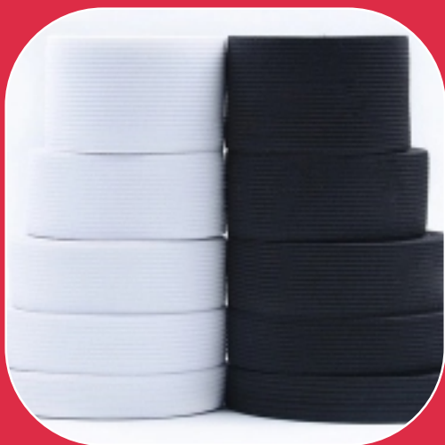
2 Inch Polyester Knitted Elastic Tape