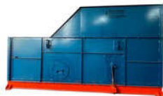
Municipal Solid Waste Bellistic Separator