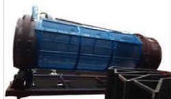
Bio Mining Plant Trommel Screens