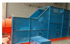
Ballistic Separator Machine For MSW