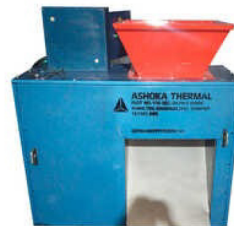
Municipal Solid Waste Twin Shaft Shredder