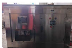
Organic Waste Composter Machine