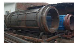
Industrial Rotary Trommel Screens