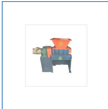
VEGETABLE WASTE SHREDDER