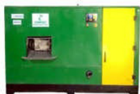
Automatic Fully Mechanised Organic