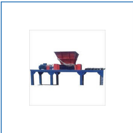
BIOMEDICAL WASTE SHREDDER

10 HP Twin shaft Shredder, Automatic Fully mechanised Organic Waste Machine, Bag Opener Chamber, Bag Opener Machine, Ballistic Separator Machine for MSW Waste Segregation, Bio Mining Plant Trommel Screens, Biomedical Waste Shredder, Conveyor Belt, etc.