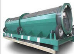
Rotary Trommel Screens