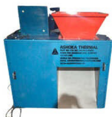
10 HP Twin Shaft Shredder