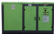
Automatic Fully Mechanised Organic