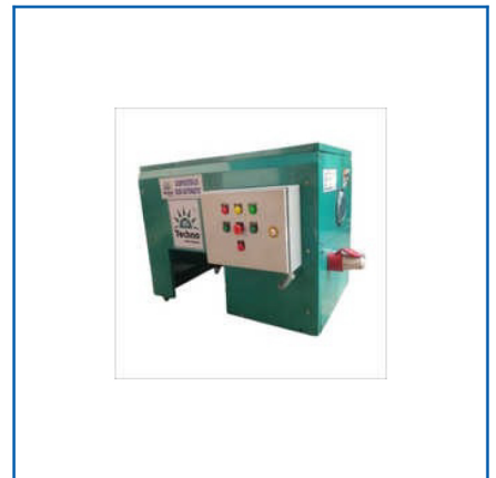
ORGANIC WASTE CONVERTOR SEMI AUTOMATIC