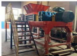
Twin Shaft Shredder Machine