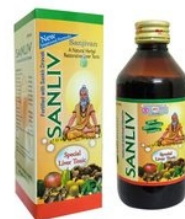
SANLIV (SPECIAL LIVER TONIC)