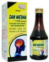
San Medha Syrup