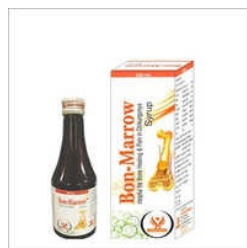
BONE FORMATION SYRUP