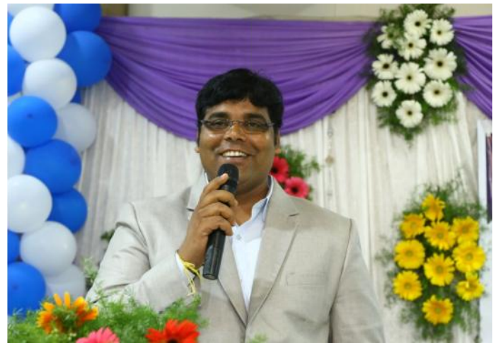
MD's message to all employees'

"To work in passionate way it will gives us best result."