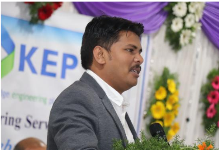
Director message to all employees'

"To work in passionate way it will gives us best result."