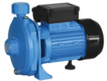
50 Hz Centrifugal Pumps