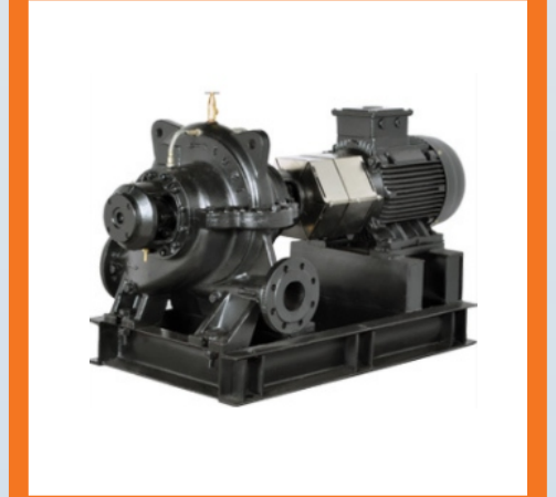
Horizontal Split Case