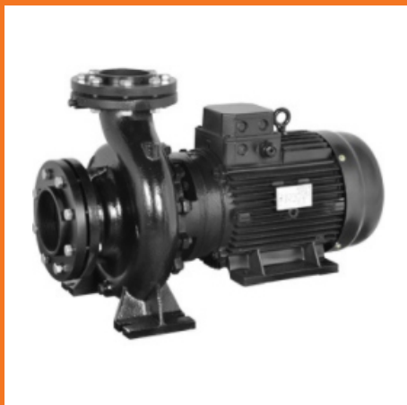
60 Hz End Suction Pump