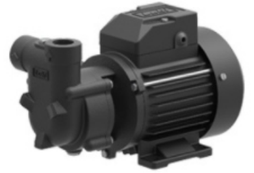
Self Priming Centrifugal RO Feed Pump