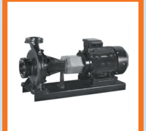
50 Hz Bare Shaft Pump