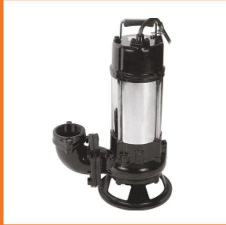
Submersible Sewage Pump 2 Inch