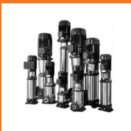
50 Hz Vertical Multistage Pump