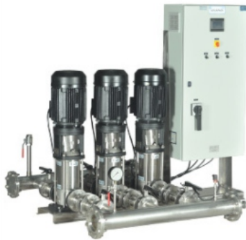
Pressure Booster System