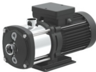
Multistage Centrifugal Pump