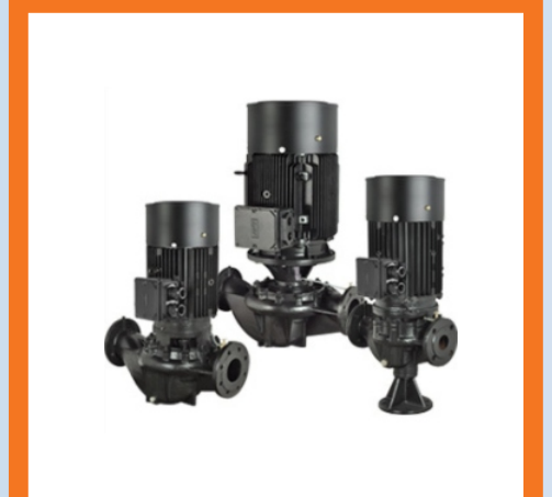
Vertical In Line Pump