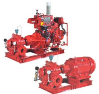
Horizontal Split Case Fire Pumps UL Listed