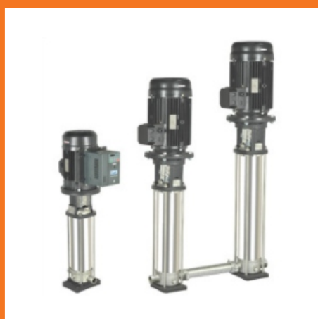
High Pressure Vertical Multistage Centrifugal Pumps