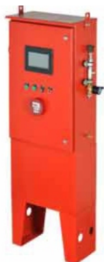
Fire Pump Controllers