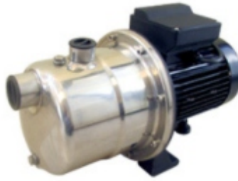
Self Priming Pump